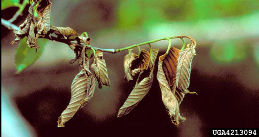
▲ Figure 2. Wilting leaves on a flag branch is a characteristic symptom of DED.