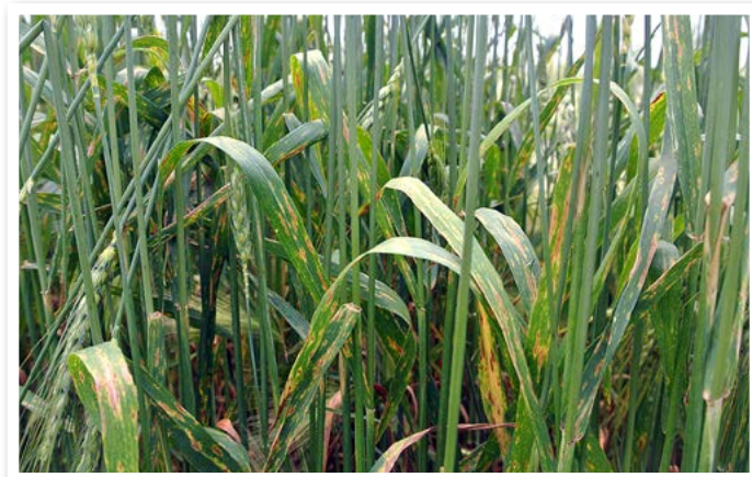
Figure 10. When fungal leaf spot diseases are not managed, significant damage can occur on the flag leaves.