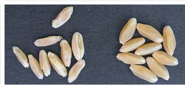
Figure 8. Shriveled durum kernels (left) caused by SNB and normal durum kernels (right).