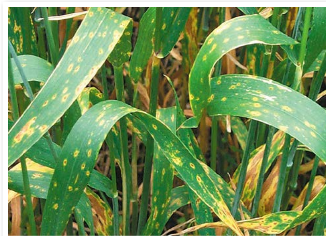
Figure 1. Wheat leaves with tan spot symptoms; note tan, necrotic center with yellow halo.

Zhaohui Liu Wheat Pathologist Department of Plant Pathology