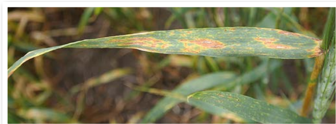
Figure 6. Symptoms of SNB. Notice the lens-shaped lesions with ashen gray centers and black specks (pycnidia).

Integrated disease management is the best approach to reduce losses attributed to the foliar leaf spot complex (Figure 10). These include a combination of host plant resistance, seed quality, crop rotations, residue management and fungicides.