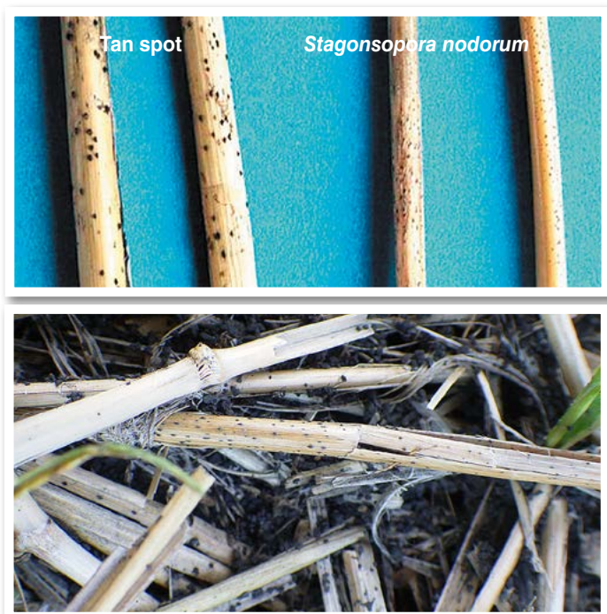
Figure 3. Notice the fungal structure size difference between the tan spot and Septoria/Stagonospora pathogens (top image). Overwintering structures for the tan spot fungus on wheat residue (bottom image).

The fungal pathogen also can produce multiple HST that enhance disease development. The level of susceptibility in wheat varieties is dependent on the type and amount of HST produced by the SNB pathogen.