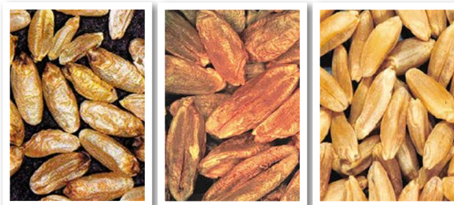
Figure 2. Comparison of durum seeds exhibiting “red smudge” symptoms (left and middle) and healthy durum (right). (NDSU photos)