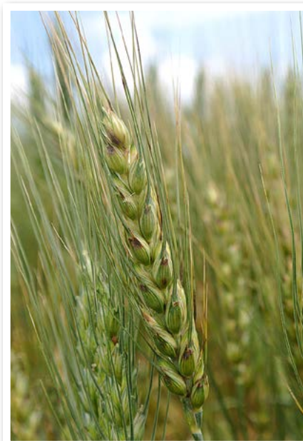
Figure 7. Glume blotch symptoms caused by Septoria/Stagonospora . Notice the dark brown to purple blotches on the glumes.