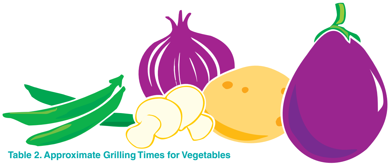
Table 2. Approximate Grilling Times for Vegetables