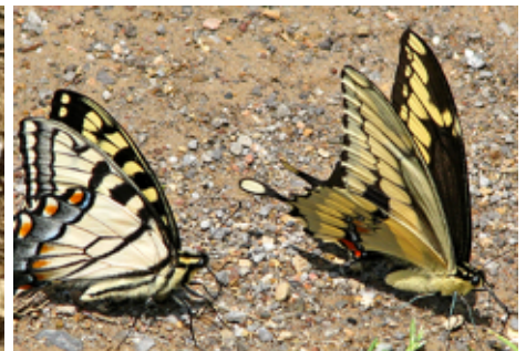
Figs. 1–3. Canadian tiger swallowtail feeds on nectar of lantana; red admiral casts its shadow while basking on rocks; swallowtails gather minerals from soil.

Select different flowers to make nectar available to adults from spring through fall. Butterflies are generally attracted to purple, orange, yellow and red flowers. Popular selections include blazing star, butterfly bush, phlox, cleome, coneflower, sedum, goldenrod, cosmos, dianthus, petunia and zinnia. Don't forget milkweed—it's essential for monarchs.