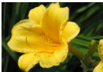
F2. Stella De Oro* Revolutionized landscaping. Blooms all summer.

You can judge for yourself by going to the NDSU gardens in Fargo. The gardens are open to the public and located at 12th Avenue North and 18th Street North.