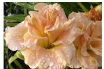
F9. Siloam Double Classic* Ruffled blooms with sweet scent. Extended blooms.

Figs. 2–9. Popular daylilies in the Midwest. The asterisk after variety names indicates it is a winner of the Stout Silver Medal. This is the highest award of the American Hemerocallis Society and awarded to only one proven variety per year.