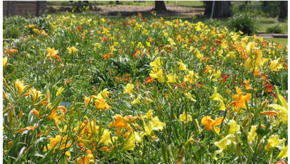
Fig. 1. North Dakota State University has the largest collection of daylilies in the USA. Over 1,200 varieties are on display.

Today there are THOUSANDS of daylilies to choose from. Which one is best for you? Ask the experts. Go