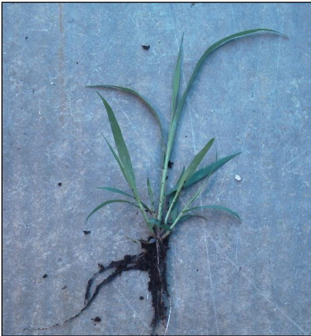
Figure 1. Stinkgrass seedling with four tillers after 3 weeks of growth in the greenhouse.

The stinkgrass name is because of the pungent odor emitted when the leaves are brushed or crushed. The leaf blade margins and stem have tiny wart-like glands. The plant seldom grows taller than 18 inches. Leaves are flat and the ligule is a short fringe of hairs, similar in general appearance to foxtails. A unique characteristic is a tuft of stiff hairs, 1/8 to 1/4 inch in length, at the leaf collar that give it a whisker-like appearance. The underside of each leaf has a row of long, sparse hairs. Stinkgrass has a round stem, no auricles, and no hair on the upper leaf surface. Inflorescence is a densely bunched panicle. Each spikelet has several florets, 7 to 40, stacked so each spikelet has appearance of a lance shape.