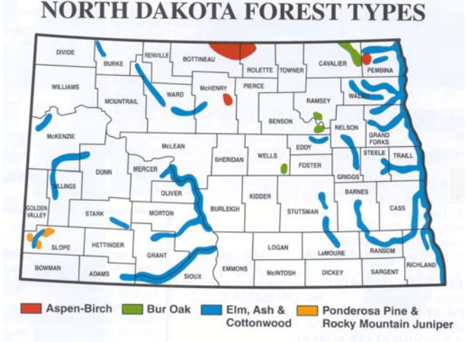
Figure 1. The native forests of North Dakota.

winds and regular wildfires, kept North Dakota mostly treeless. The native forests of North Dakota were, and still are found mainly along the rivers and streams of the state (Figure 1).