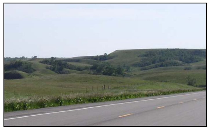
Figure 3. A collection of wooded draws on north- and east-facing slopes in Mercer County, N.D.

An important forest type not reflected in Figure 1 is the collection of "wooded draws" found throughout western North Dakota (Figure 3). Wooded draws grow where there is a little extra moisture in the soil, such as north- or east-facing slopes (Barker and Whitman 1989). Many tree and shrub species are found in them and the dominant species will vary by location. For example, just west of the Missouri River, the wooded draws tend to be dominated by deciduous species, such as green ash and quaking aspen. Toward the Badlands, the forest switches to a mixture of deciduous trees and Rocky Mountain juniper, then to mostly ponderosa pine and juniper. There are various combinations between the extremes.