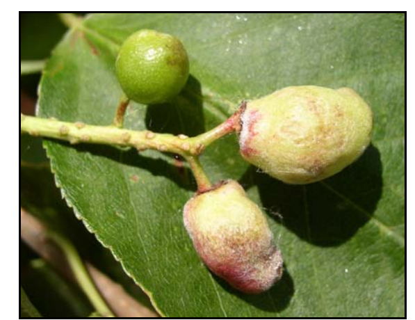
Figure 1. Cluster of chokecherry fruits with two containing larvae of the chokecherry midge and one normal fruit.

The chokecherry midge ( Contarinia virginianiae ) is an elusive insect. Although it is a fairly common species, very little is known about it. In fact, I was unable to find any published reports in scientific journals or in major books that cover insect pests of trees. Only a few Extension Service publications in the U.S. cover the topic. There are some reports from the Canadian government. All the reports are similar.