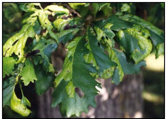
Figure 1. Typical appearance of oak leaf blister symptoms in early June.

Oak leaf blister is a foliar disease caused by the fungus Taphrina caerulescens . As the name implies, symptoms appear as slightly raised bulges (blisters) on the leaf. During early to mid-summer, the upper surface of the blisters appears lighter in color compared with adjacent uninfected leaf portions (Figure 1). The undersides of these blisters often appear gray. Blisters range in size from 3 to 20 millimeters across, but at times coalesce and encompass the entire leaf. By mid- to late- summer, the upper surface of these blisters may desiccate and turn brown. Severely blistered leaves may curl and prematurely fall from the tree (Conway and Watkins 1986, Sinclair et al. 1987).