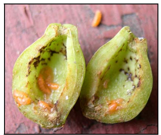
Figure 2. Larvae of the chokecherry midge appear as orange maggots. They will continue to feed until mid-summer, then drop to the ground to pupate and overwinter. The fruit will dry and fall before the normal fruit ripen.

Chokecherry midge damage (Figure 1) appears in June and July as enlarged, pear-shaped fruits. The larvae are found inside the fruit (Figure 2) as orange maggots. They destroy the seed and leave the fruit hollow. The destroyed fruit often falls off before the normal fruits ripen. After the maggots have finished feeding inside the fruit, they drop to the ground to pupate during the winter. Adults emerge the following spring, probably around the time the chokecherries are blooming. They lay eggs in the flowers. Following the hatch, the larvae move into the developing fruit.