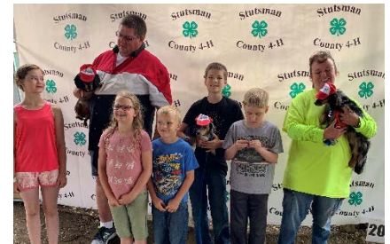
2019 Cast of Winners!

Get caught up in the fun and excitement of the race!!!