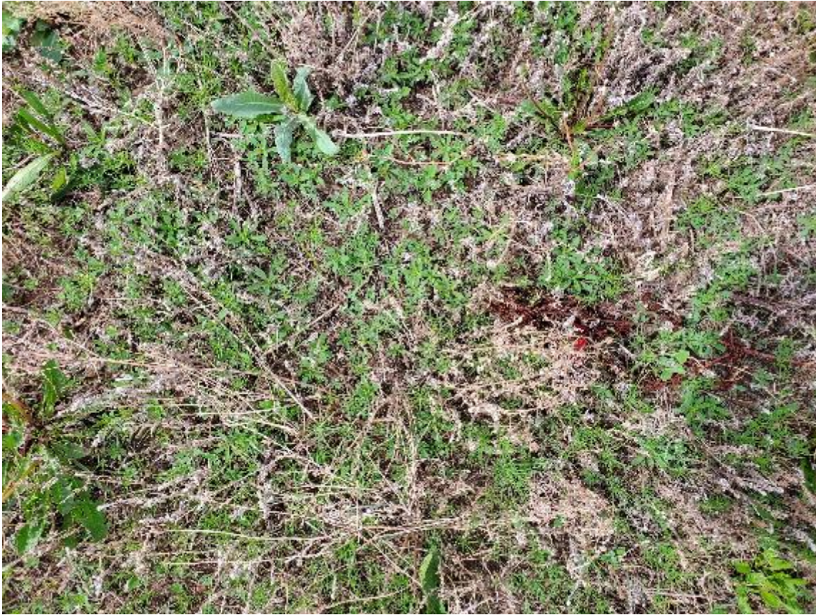
No Fall Valor