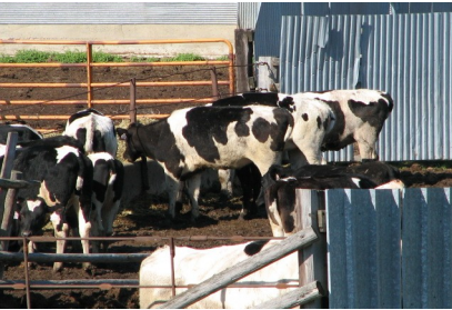
Feeding and watering area