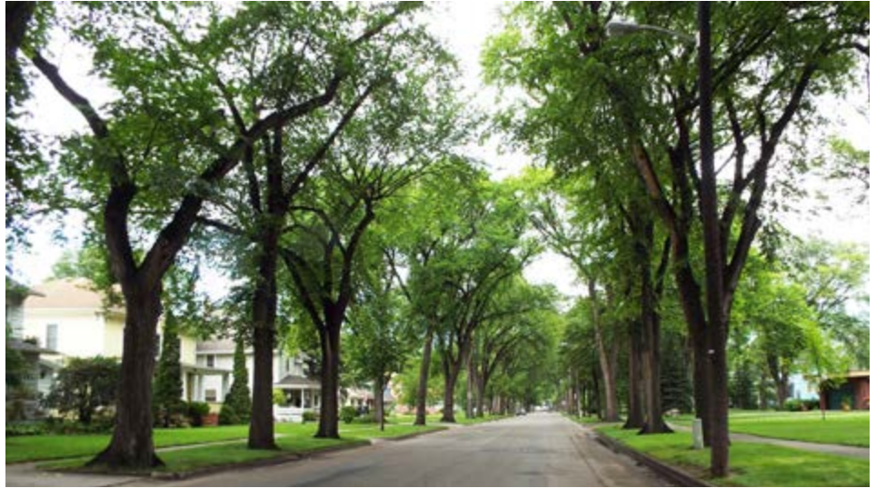
These stately American elm trees frame a Grand Forks neighborhood.

Pruning out infected branches can also be effective. Prune well below branches showing symptoms. Remove at least 8 to 10 feet of branch that is free from the brown discoloration