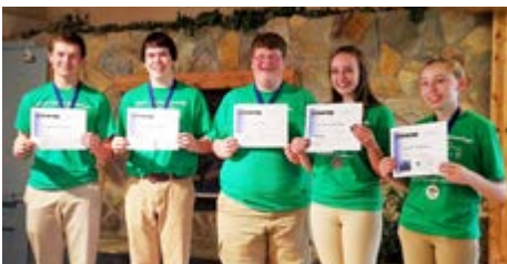
1st Place ND State Envirothon Bismarck High School Bismarck, ND