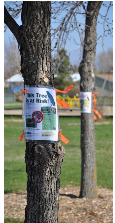
The ash trees at Tommy Turtle Park in Bottineau educate visitors on the threat and implications of EAB.

It is important for North Dakota communities to be aware of and prepared for EAB. Since 2012, the North Dakota Forest Service has inventoried municipal trees in over eighty North Dakota communities. The average city tree in North Dakota is eleven inches in diameter and is in good to fair condition. It is also as likely to be an ash tree as it is to be any other tree. Green ash itself makes up over 46 percent of our municipal tree population. Black and Manchurian ash comprise an additional two percent of ash species susceptible to EAB in municipal plantings. This makes North Dakota more vulnerable to the EAB than any other state that has been infested with the pest. To ensure North Dakota remains EAB-free, early detection is important. Currently, communities are reducing the potential future impact of EAB by increasing awareness of the pest and by planting other tree species.