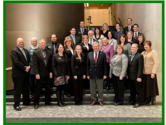
RLND Proclamation Day with Governor Dalrymple

legislative process and we participated in mock committee hearings. We put our new knowledge to use as we observed committee hearings at the Capitol. This year marks the first year of the Governor's proclamation of Rural Leadership North Dakota Day.