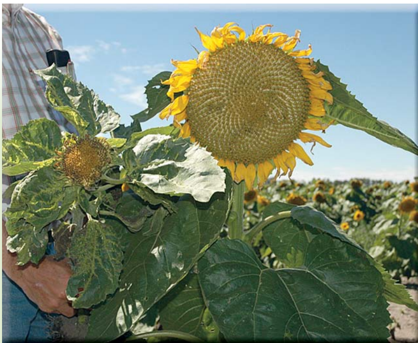
Figure 1. Downy mildew infected sunflower (left) compared to healthy sunflower (right).

D owny mildew is a common sunflower disease found in North Dakota and other northern Great Plains states and is capable of killing or stunting plants (Figure 1), reducing stands and causing yield loss. According to NDSU sunflower-disease surveys done between 2001 and 2008, 29 percent of North Dakota fields had downy mildew, and the disease was found in all sunflower growing areas of the state (Figure 2). When downy mildew is sporadic throughout the field, sunflowers are able to compensate for the infected plants and limit the amount of yield loss. However, downy mildew often occurs in heavily diseased patches, which limits the plants' abilities to compensate for the infected areas on a fieldwide scale.