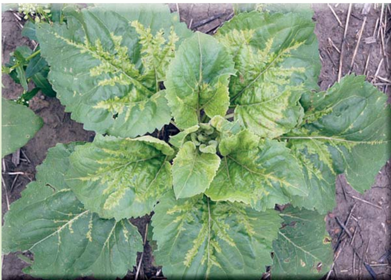
Figure 4. Systemically infected plant with typical chlorotic symptoms bordering and covering leaf veins.