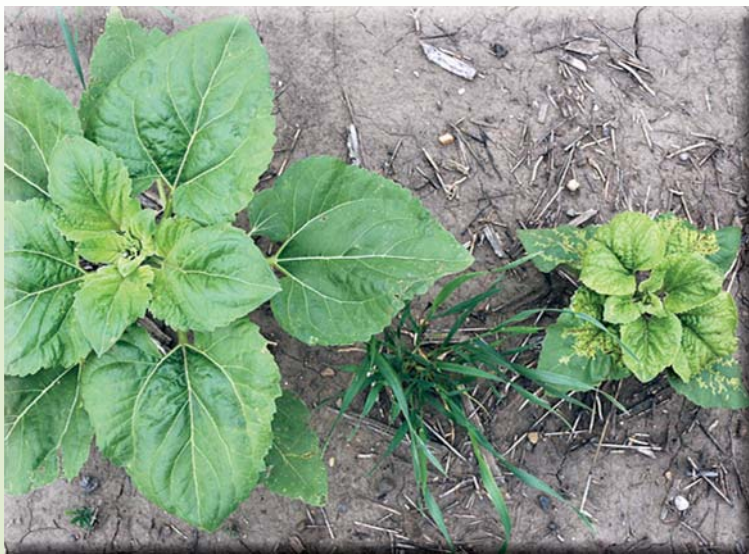
Figure 6. Systemically infected sunflower (right) compared with healthy sunflower (left); note severe dwarfing.

Plasmopara halstedii survives for up to 10 years in soil as sexual, thick-walled oospores. Oospores are produced just beneath the epidermis of infected plants and are more common in roots than leaves. When soils are cool and water-saturated, oospores will germinate and form zoosporangia, which give rise to asexual, motile zoospores. Systemic infection results when zoospores infect the sunflower seedling before the root reaches 2 inches in length. Sunflower plants that survive this initial infection produce white zoosporangia on the underside of the chlorotic areas of leaves. When windborne zoosporangia land on sunflower leaves, secondary infections may occur. Secondary infection is most common when sunflower leaves remain wet for prolonged periods of time. Plants are susceptible to secondary infection for a much longer period than for systemic infection via root infection.