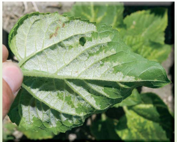
Figure 5. Masses of spores on underside of leaf; note white, cottony appearance