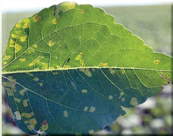
Figure 7. Secondary infection resulting in angular “local” lesions.