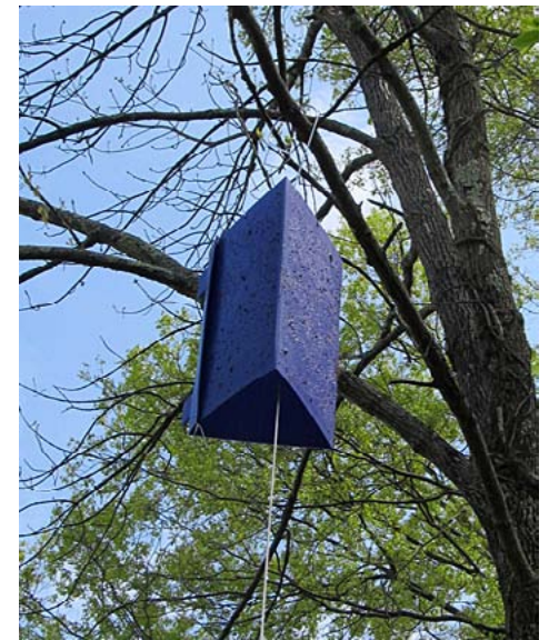
Figure 17. Purple prism trap used for surveying for emerald ash borer

Simple visual monitoring by the general public is also critical because the trapping materials and techniques have not been perfected yet. If you suspect that EAB is in your ash trees, contact one of the organizations listed at the end of this publication.