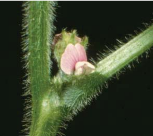
Soybean flower