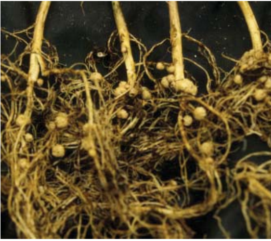
Nodules on soybean roots