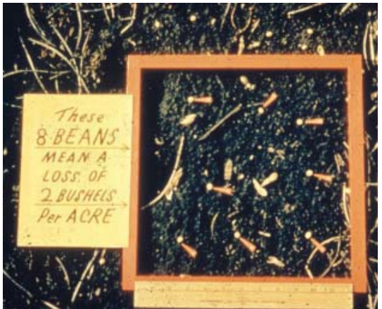
Harvest loss: four beans per square foot is 1 bu/a