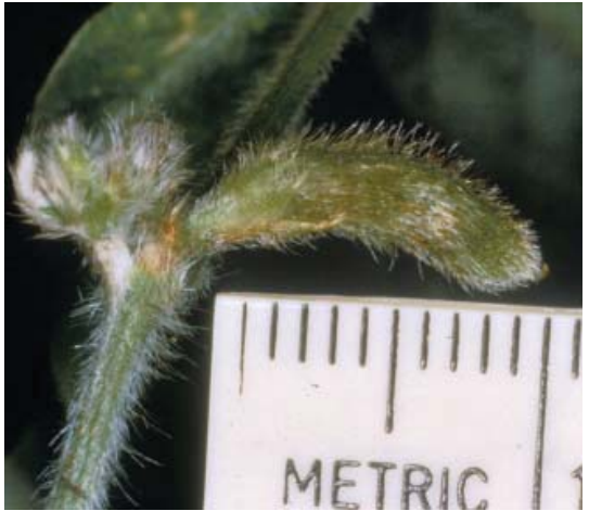
Soybean pod 10 mm long