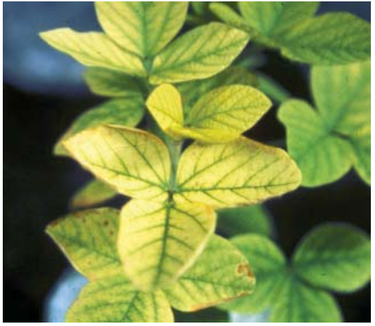
Iron chlorosis deficiency