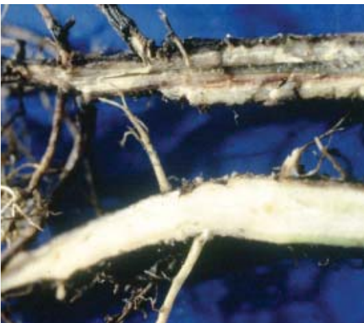
Fusarium root rot