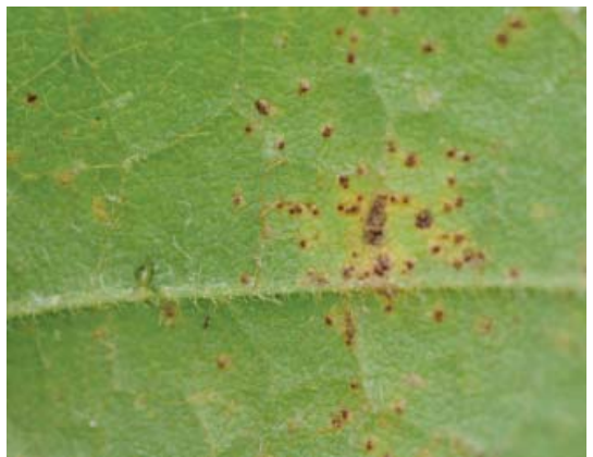
Soybean rust through hand lens