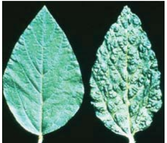
Leaf puckering from virus