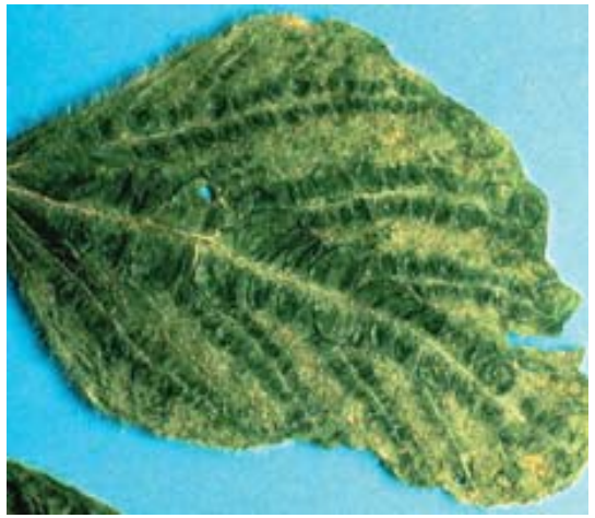
Leaf distortion from virus