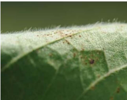
Soybean rust pustules through hand lens