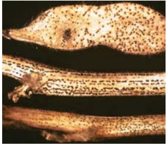
Pod and stem blight