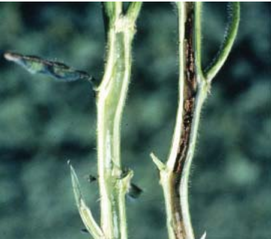
Brown stem rot