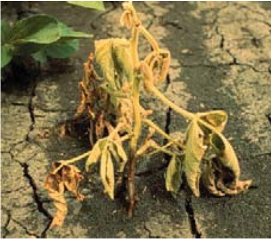
Phytophthora root rot