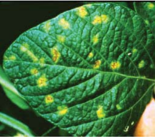
Downy mildew