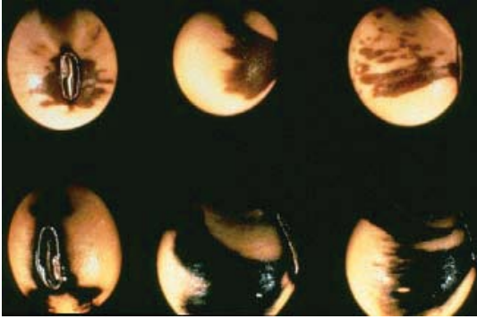
Seed mottling from virus