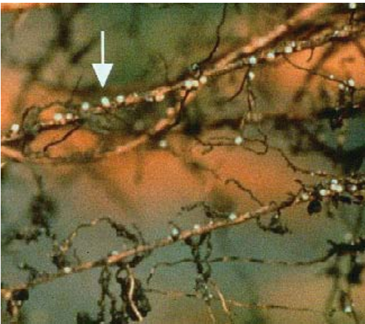
Soybean cyst nematode