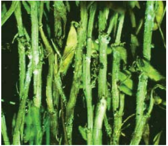
White mold