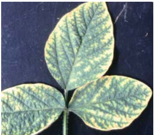
Sudden death syndrome