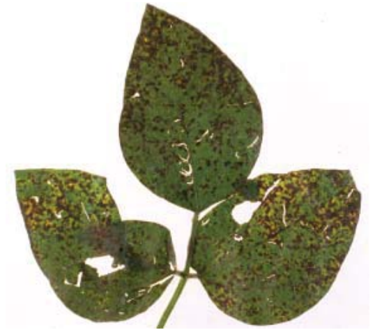
Septoria brown spot