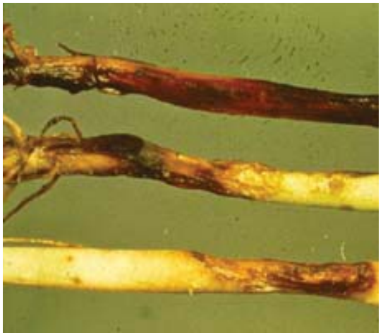
Rhizoctonia root rot