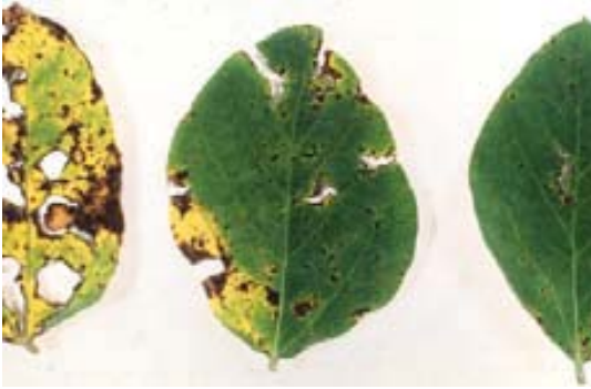
Bacterial blight