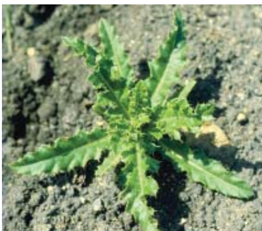
Fig. 8. Canada thistle