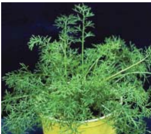
Fig. 13. False chamomile, adult (NDSU Extension Service)