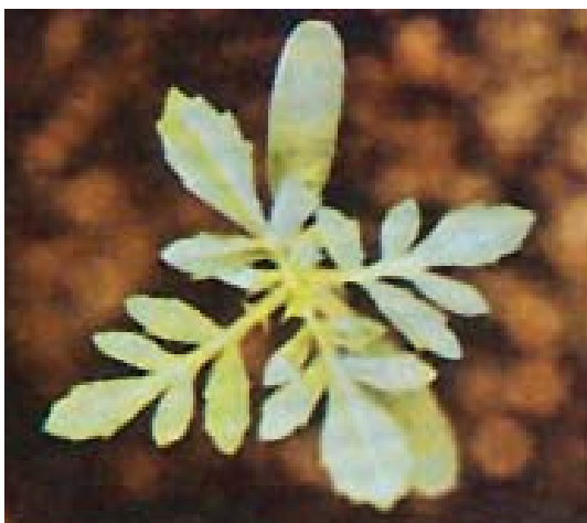
Fig. 11. Common ragweed