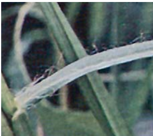
Fig. 33. Yellow foxtail (NDSU Extension Service)