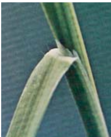
Fig. 31. Wild oat