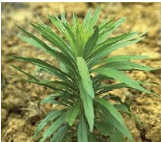
Fig. 18. Horseweed, immature (NDSU Extension Service)