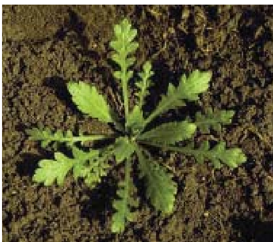
Fig. 27. Shepardspurse, rosette (NDSU Extension Service)