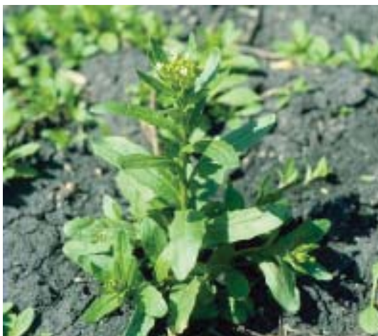
Fig. 15. Field pennycress