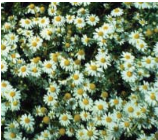
Fig. 14. False chamomile, flowers