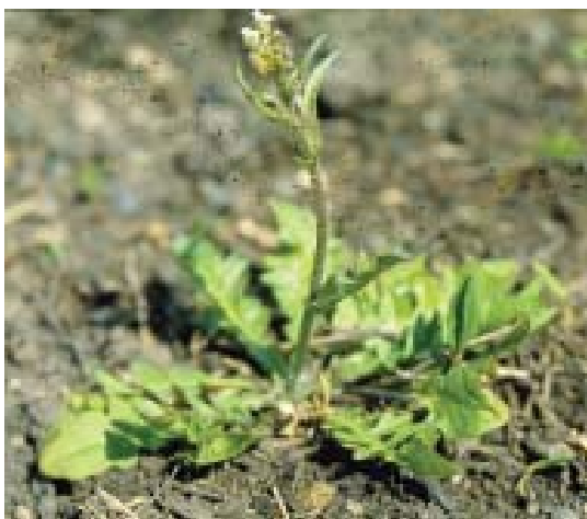
Fig. 28. Shepardspurse, bolting (NDSU Extension Service)