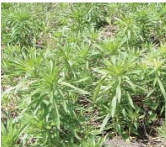
Fig. 19. Horseweed (NDSU Extension Service)