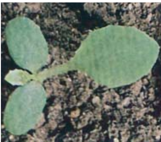
Fig. 24. Perennial sowthistle