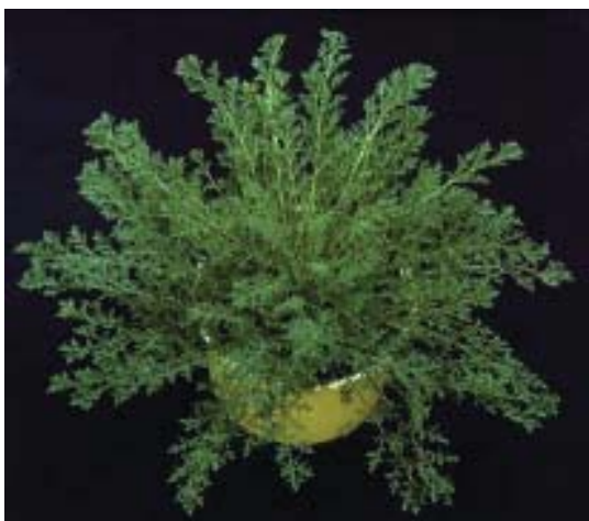
Fig. 16. Flixweed (NDSU Extension Service)