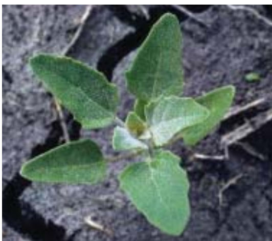
Fig. 21. Lambsquarters (NDSU Extension Service)