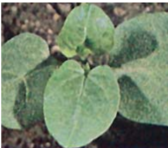
Fig. 12. Field bindweed (NDSU Extension Service)