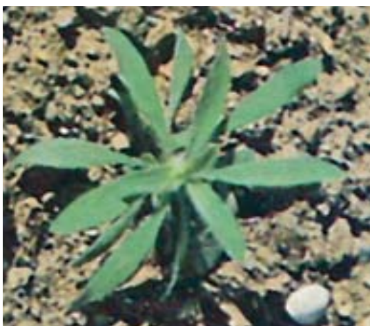
Fig. 20. Kochia (NDSU Extension Service)