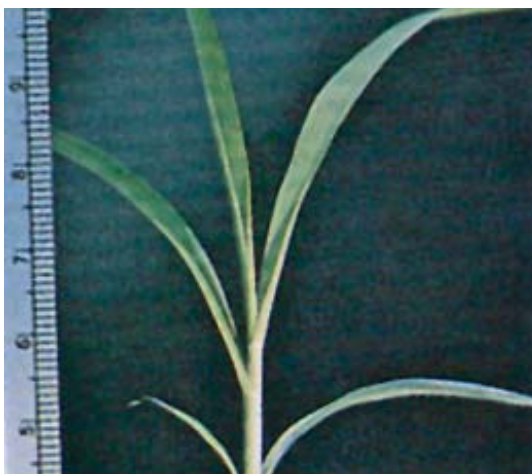
Fig. 17. Green foxtail (NDSU Extension Service)