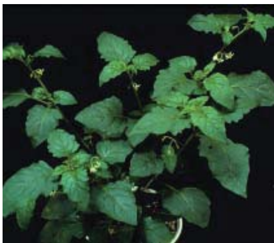
Fig. 7. Black nightshade