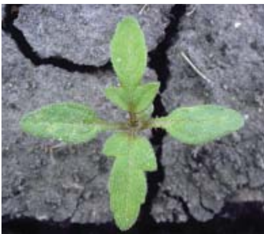
Fig. 22. Marshelder (NDSU Extension Service)