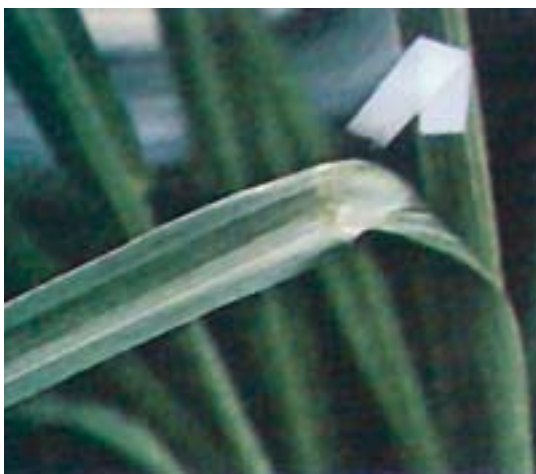
Fig. 4. Barnyard grass