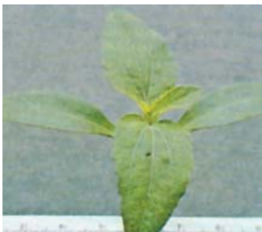
Fig. 9. Cocklebur