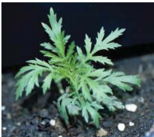
Fig. 5. Biennial wormwood, seedling (NDSU Extension Service)