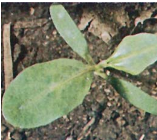
Fig. 23. Pennsylvania smartweed (NDSU Extension Service)