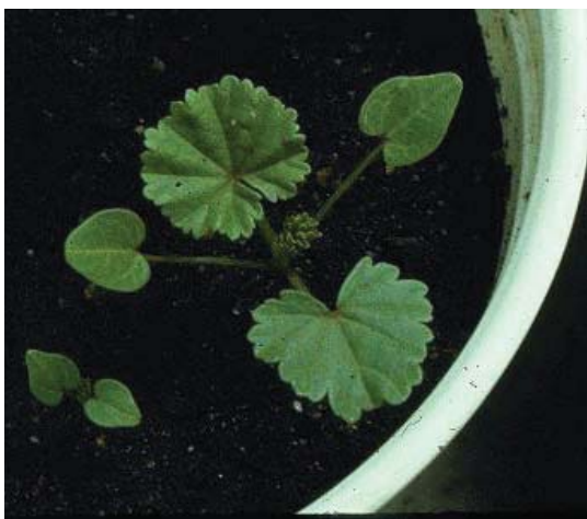
Fig. 10. Common mallow (NDSU Extension Service)