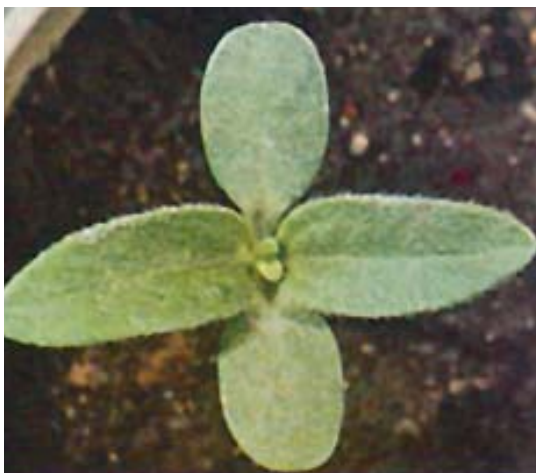
Fig. 32. Wild sunflower (NDSU Extension Service)