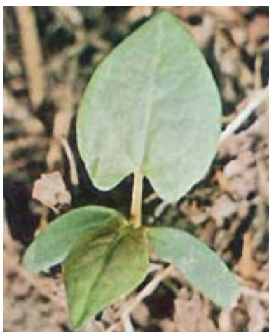
Fig. 29. Wild buckwheat