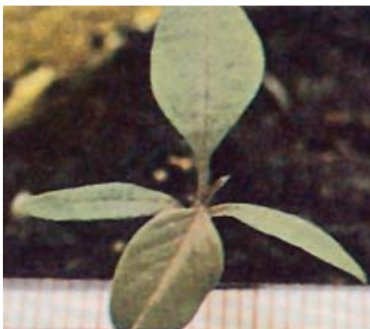
Fig. 25. Pigweed