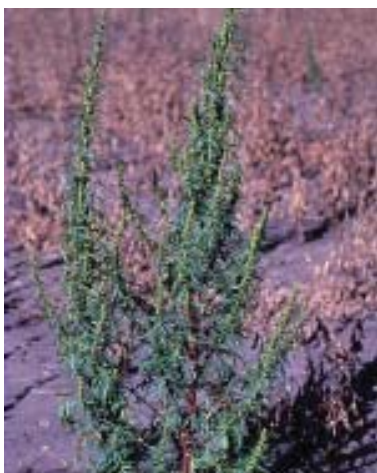
Fig. 6. Biennial wormwood, adult (NDSU Extension Service)