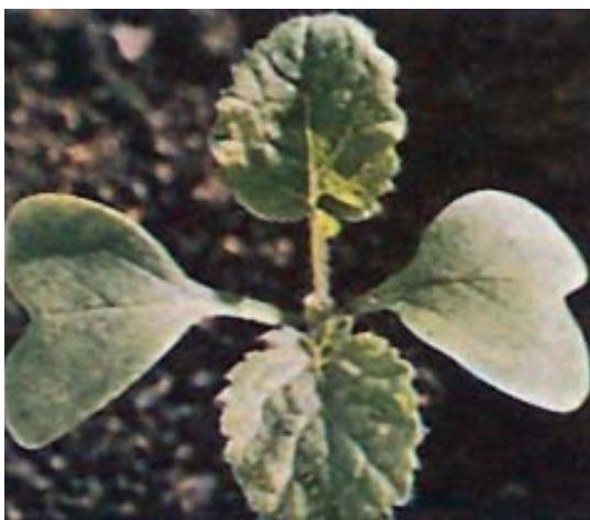
Fig. 30. Wild mustard