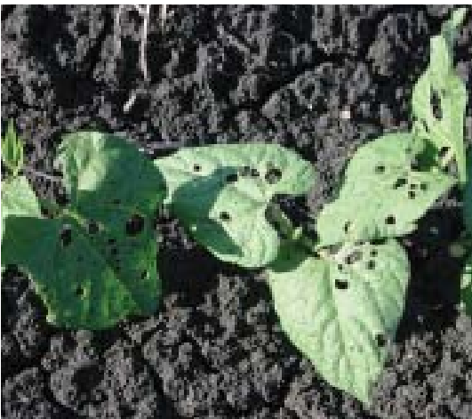
Fig. 56. Bean leaf beetle defoliation (J. Knodel, NDSU)