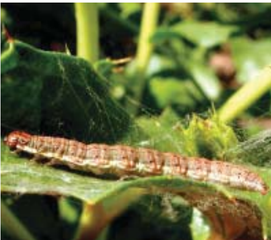
Fig. 68. Alfalfa webworm larva (J. Knodel, NDSU)