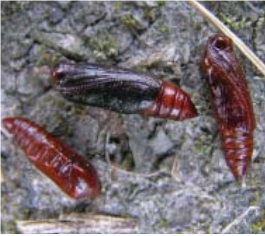
Fig. 64. Green cloverworm pupae