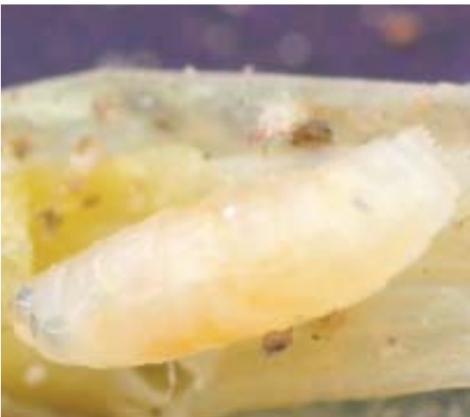
Fig. 74. Seedcorn maggot larva