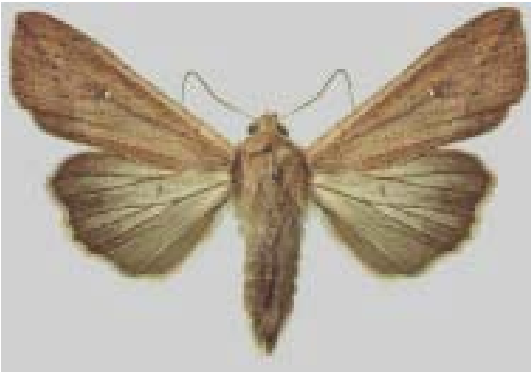
Fig. 54. Armyworm adult