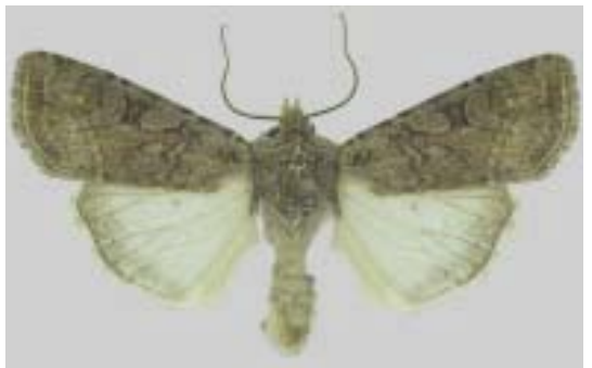
Fig. 57. Darksided cutworm adult