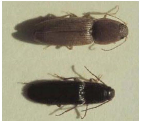
Fig. 79. Click beetles (adult wireworm)