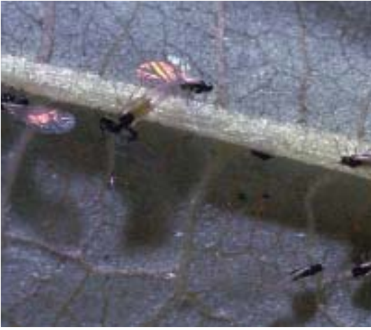
Fig. 52. Winged bean aphids