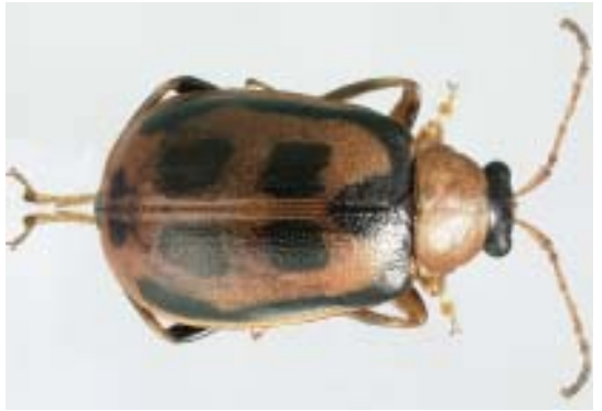
Fig. 55. Bean leaf beetle adult