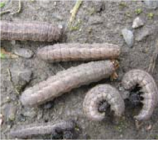
Fig. 58. Dingy cutworm larvae