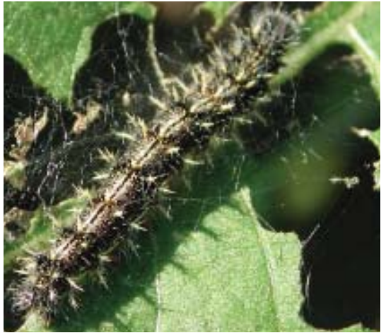
Fig. 67. Thistle caterpillar