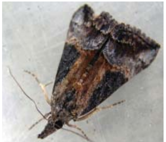
Fig. 63. Green cloverworm adult