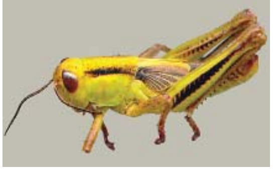
Fig. 71. Grasshopper nymph