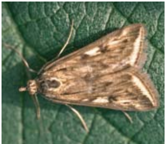
Fig. 69. Alfalfa webworm adult