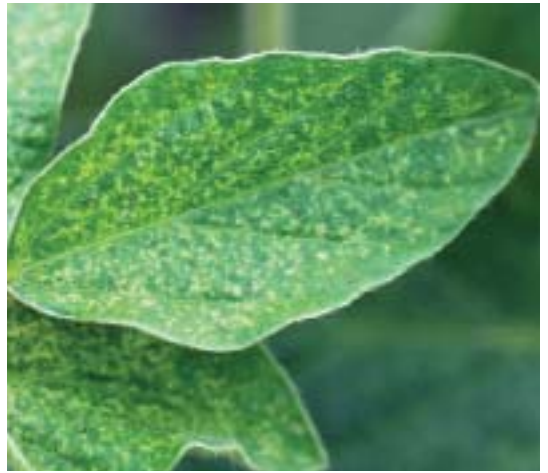
Fig. 77. Two-spotted spider mite stippling injury on leaves