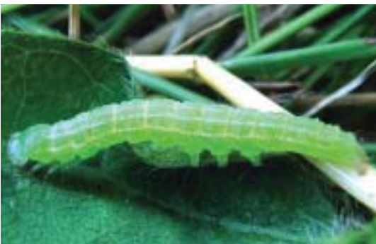
Fig. 62. Green cloverworm larva