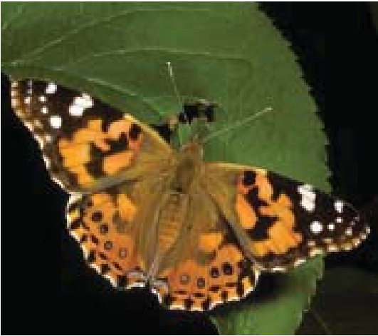
Fig. 66. Painted lady butterfly