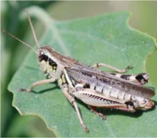
Fig. 70. Red-legged grasshopper adult