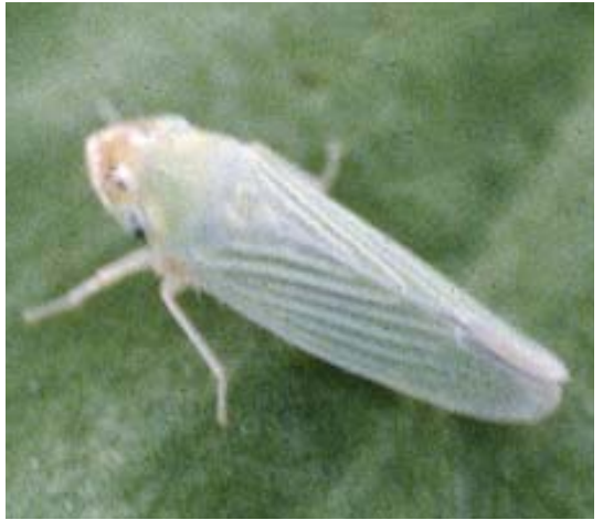
Fig. 73. Potato leafhopper adult