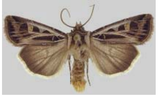
Fig. 59. Dingy cutworm adult (G. Fauske, NDSU)