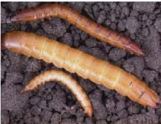
Fig. 80. Wireworm