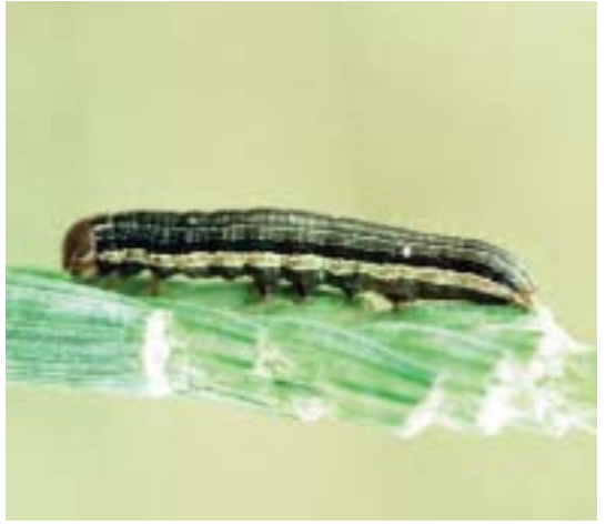
Fig. 53. Armyworm larva