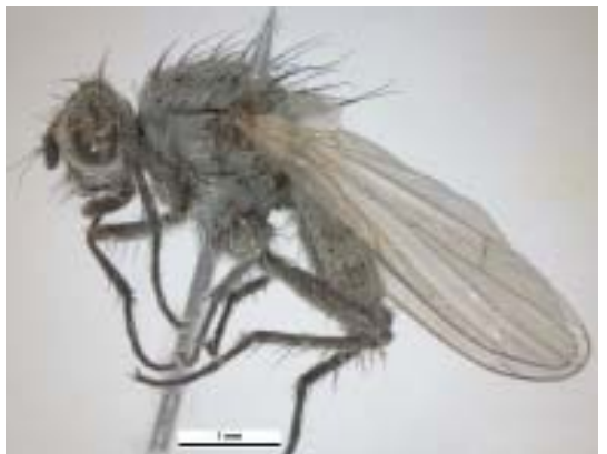
Fig. 75. Seedcorn maggot adult