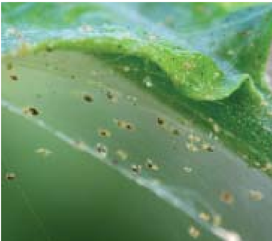
Fig. 78. Webbing from two-spotted spider mites