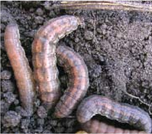
Fig. 60. Redbacked cutworm larvae (J. Gavloski, Manitoba Agriculture, Food and Rural Initiatives)