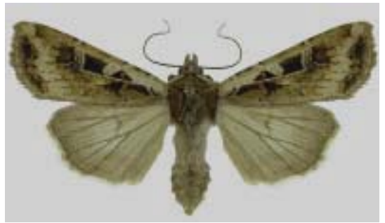
Fig. 61. Redbacked cutworm adult