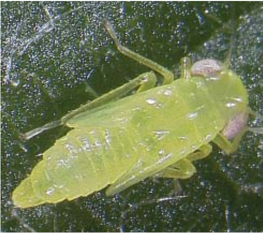
Fig. 72. Potato leafhopper nymph