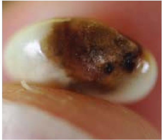
Fig. 37. Anthracnose on bean ( S. Markell, NDSU )