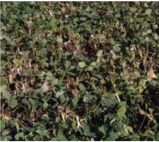
Fig. 46. Field with Sclerotinia