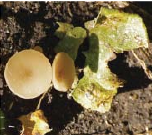
Fig. 44. Sclerotinia Apothecia