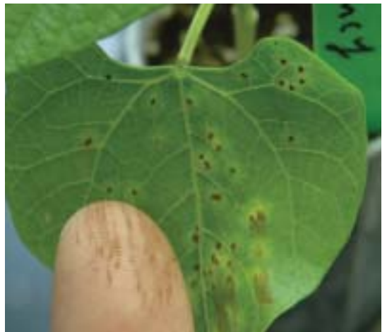
Fig. 39. Rust close up