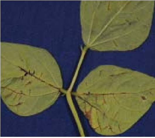
Fig. 34. Anthracnose underside of leaf