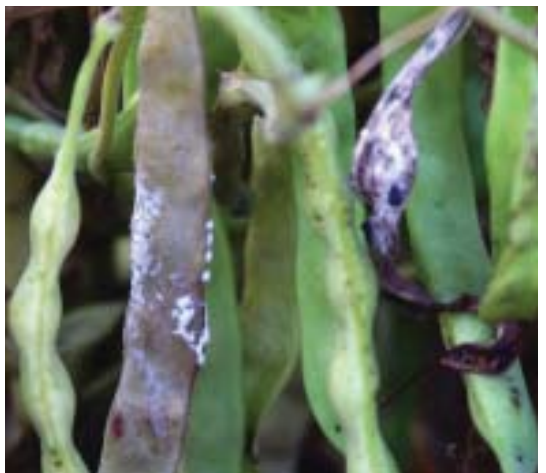
Fig. 51. Sclerotinia on pods