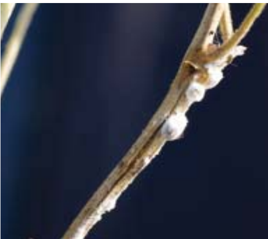
Fig. 50. Sclerotinia on stem (M. Wunsch, NDSU)