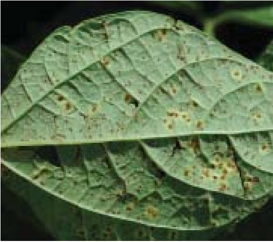
Fig. 40. Rust under side of leaf