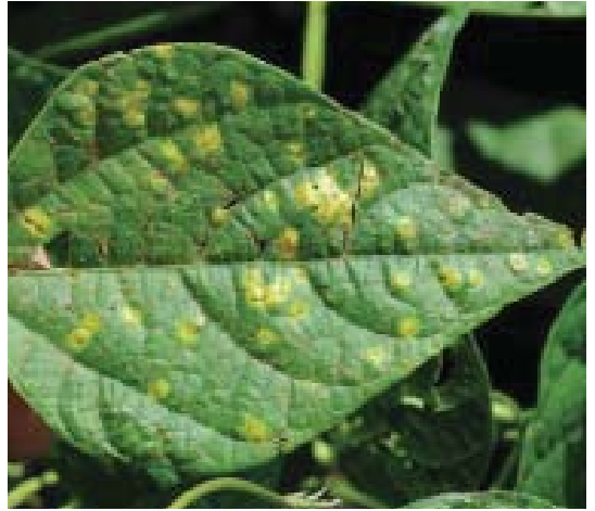
Fig. 41. Rust upper side of leaf