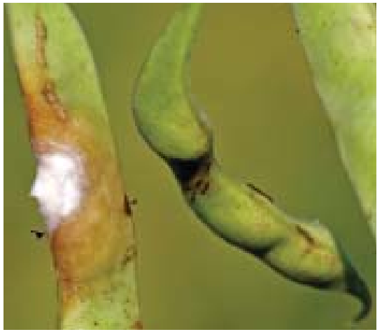
Fig. 47. Sclerotinia on pod