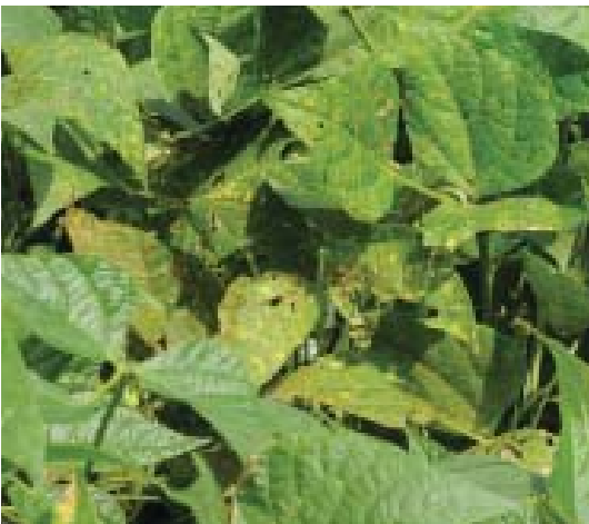
Fig. 38. Rust hot spot