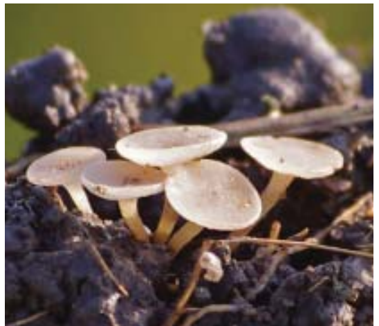
Fig. 45. Sclerotinia Apothecia