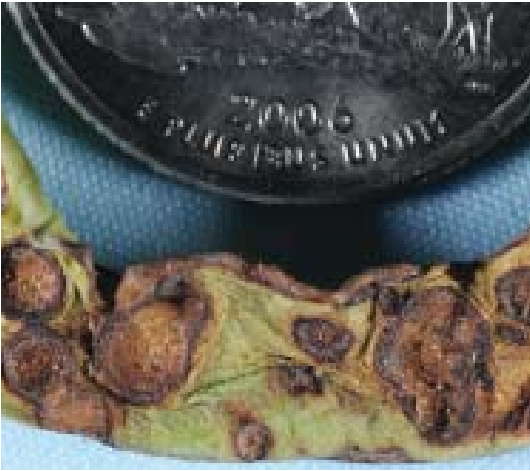
Fig. 36. Anthracnose on pod