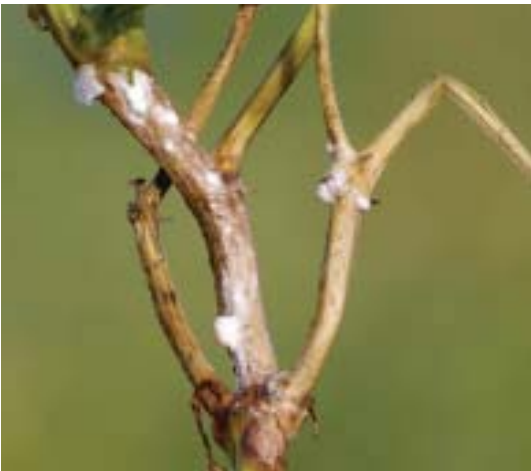
Fig. 48. Sclerotinia on stem