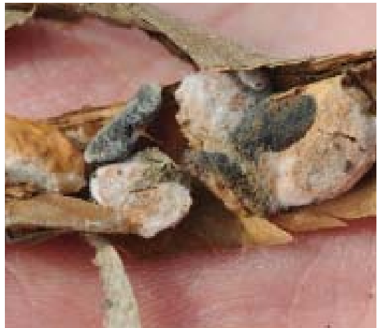
Fig. 43. Sclerotia (sclerotinia) in pod