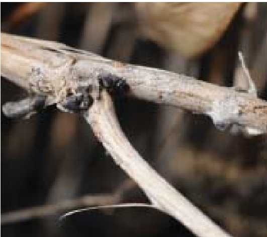
Fig. 42. Sclerotia (sclerotinia) on bean stem