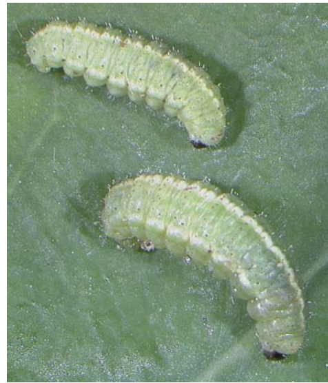
Figure 3. Mature alfalfa weevil larva