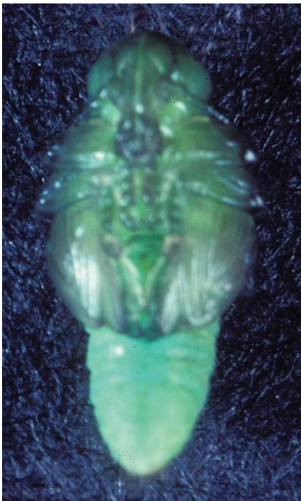
Figure 6. Alfalfa weevil pupa