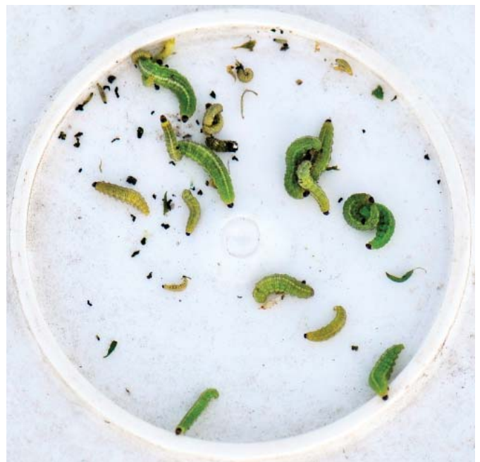
Figure 9. Alfalfa weevil larvae collected during 30-stem sampling method using a white bucket

At each sampling site in the field, select a minimum of 30 stems and cut them off at the base. Invert the cut stems into the 5-gallon pail and vigorously beat the plants in the pail to dislodge the larvae. First-instar larvae feeding in rolled leaf tips won’t dislodge easily, so be sure to examine leaf tips for larvae.