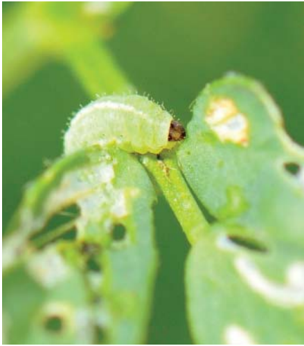
Figure 5. Alfalfa weevil larva feeding on alfalfa leaf