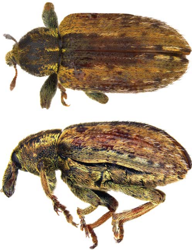
Figure 1. Adult alfalfa weevil

Adults (Fig. 1) are about 5 millimeters (mm) long (¼ inch), with elbowed, clubbed antennae and a blunt snout. Adults are brown with short, somewhat thick golden hairs over the body and a distinctive brown stripe longitudinally along the center of the back. Newly deposited eggs (Fig. 2) are cream colored, and eggs that are about to hatch are olive brown, with the black head capsule of the developing larva visible. Mature larvae (Fig. 3) are about 8 mm long (almost ⅜ inch) and have a black head capsule and a wrinkled green body with a white stripe running lengthwise along the top. Younger larvae are similar in appearance but smaller.