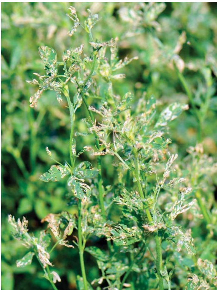
Figure 8. Close-up of alfalfa weevil defoliation