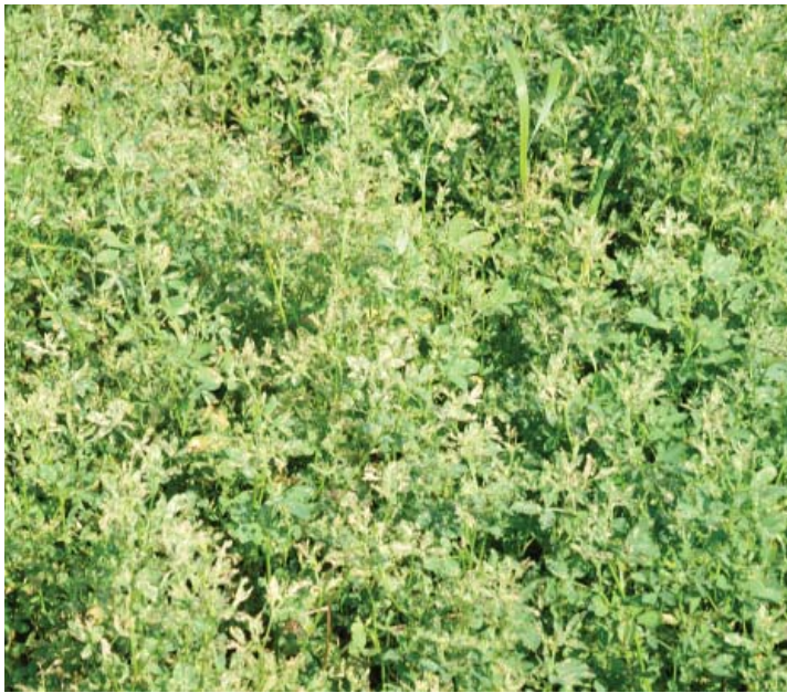
Figure 7. Alfalfa weevil feeding injury; note frosted appearance of crop