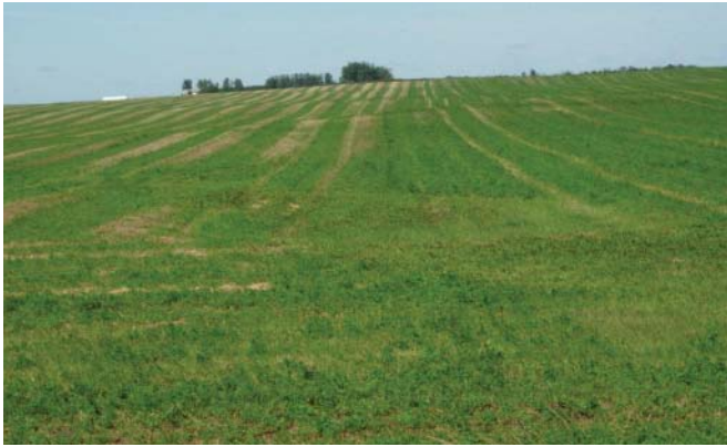
Figure 10. Alfalfa weevil larval feeding injury underneath the windrows (brown defoliated strips)