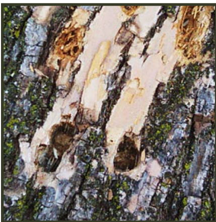
Figure 16. Woodpecker damage on emerald ash borer-infested tree

Beyond removal and replacement, the loss of benefits provided by ash trees will be enormous and expensive. Shelterbelts protect farmsteads, fields and livestock from harsh, drying winds in the summer and they capture snow in the winter, acting as living snow fences along highways and around many communities. In urban EAB-infested areas where ash trees have been destroyed, the loss of shade/protection from ash trees has resulted in increased costs associated with summer air conditioning and lawn watering, and home heating in the winter.