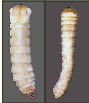
Figure 7. Comparison of prepupa of emerald ash borer (left) and red-headed ash borer (right). Circle shows two spines (urogomphi) on emerald ash borer larva (G. Fauske, NDSU)