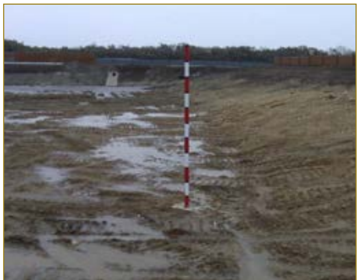
Fig. 4. Installation of pond marker when the pond is empty or under construction