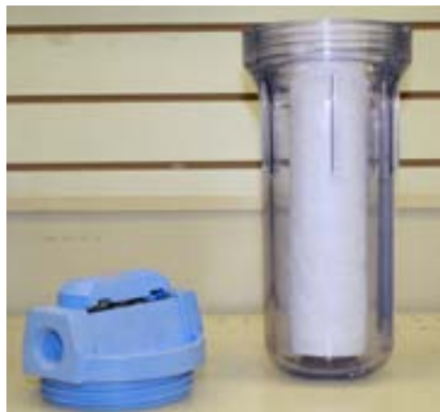
Figure 3. Clear whole-house filter housing allows you to see when filter is plugged.