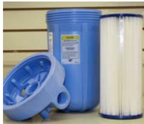
Figure 2. Whole-house filter housing with a pleated filter.