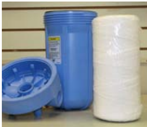
Figure 1. Whole-house filter housing with woven-string filter.