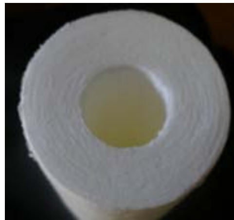
Figure 4. Close-up of a spun-polypropylene filter.

Sediment filters typically look like woven string (Figure 1), pleated paper (Figure 2) or spun polypropylene (Figure 3 and close-up Figure 4) are selected based on the particle size removed (for example, 2 microns to 100 microns). A small particle size (2- to 5-micron) filter has smaller pores and thus requires more pressure to push the water through the filtering material.