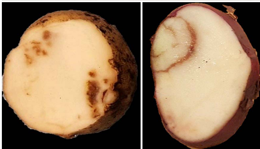
Figure 3. Varying TRV-induced necrosis in potato cultivars. Top, Left to right: Russet, specialty and red market type cultivars. (S.K.R. Yellareddygar, NDSU)