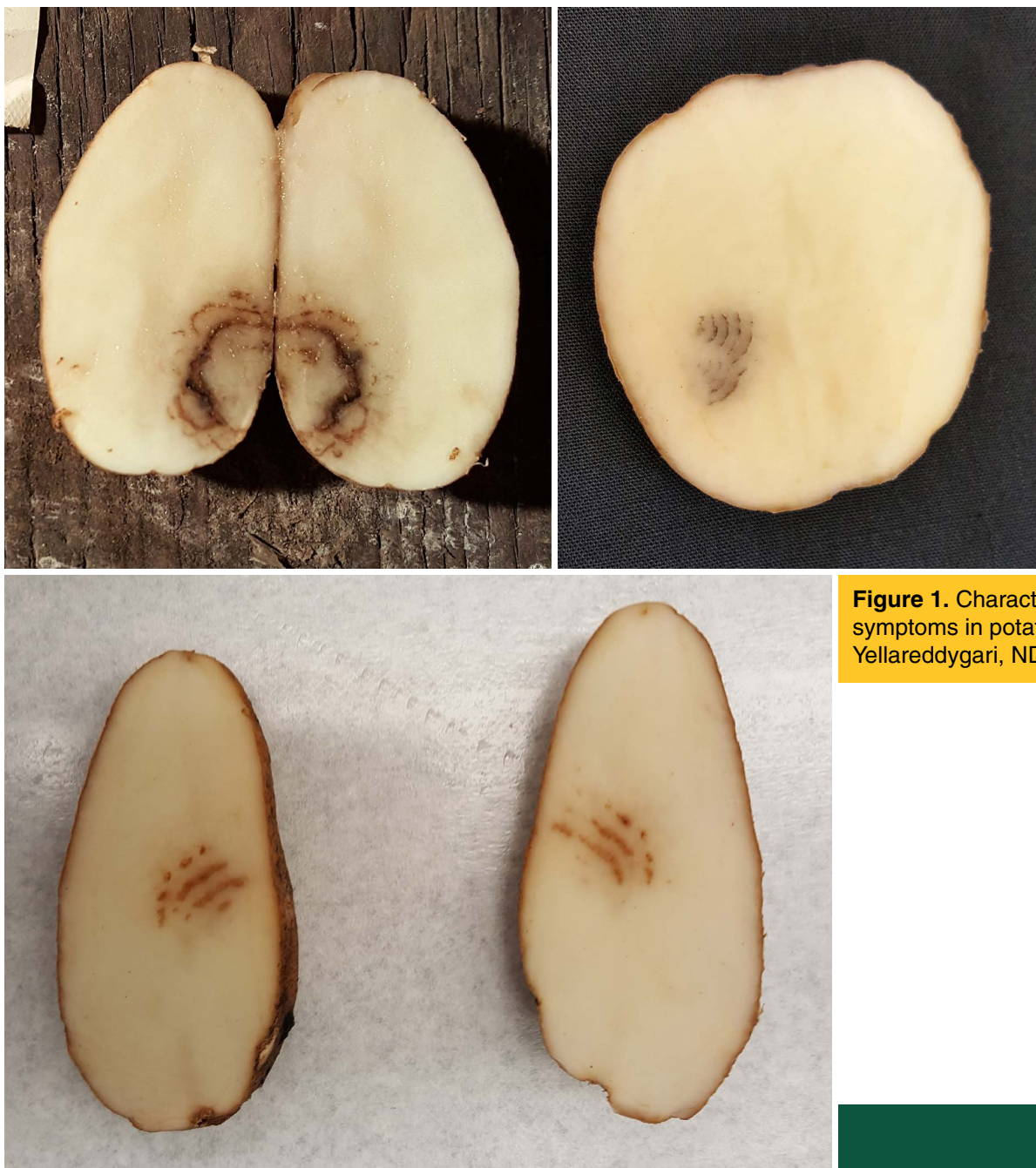
Figure 1. Characteristic TRV symptoms in potato.

Important note: The necrosis symptoms in some cultivars increase during the time that potatoes are in storage. Symptom intensity varies from cultivar to cultivar (Figure 3), field to field, location to location and year to year. Laboratory analysis is the best method to determine the specific virus.