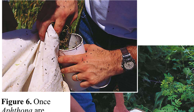
Figure 6. Once Aphthona are collected, remove as much trash as possible and place into paper cartons or bags. Keep the containers in the shade and transport

the insects in coolers with blue ice. Flea beetle sorters may be used during mass redistributions. Consult your local APHIS representative or weed control officer for availability.