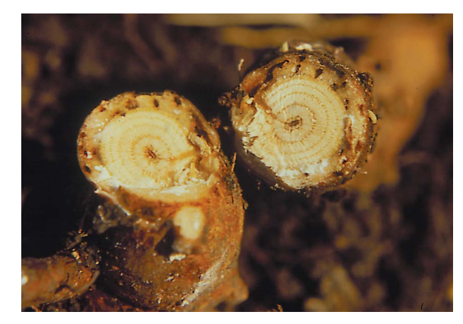
Figure 3. Larvae and holes from feeding damage in a leafy spurge root crown (top), and two larvae feeding in a leafy spurge root bud (right).