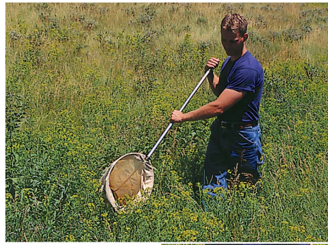
Figure 5. Sweep for Aphthona flea beetles on warm sunny days. The sweeping motion should be in an arc from left to right over the top two thirds of the leafy spurge plant. Avoid hitting rocks and soil.