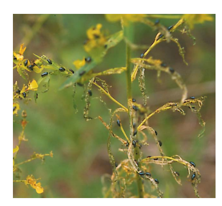
Figure 7. The larger the initial release number of adult Aphthona flea beetles, the more likely the population will establish and begin to control leafy spurge.

Grazing by sheep or goats after mid-August can increase leafy spurge control with Aphthona flea beetles. Grazing removes excess trash from the soil surface, providing a more suitable environment for egg and larvae survival. Fire may also be used to reduce cover, but avoid using a controlled burn until after mid-August when egg laying has been completed.