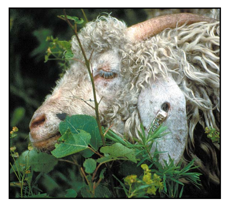
Figure 5. Angora goats will graze leafy spurge and shrubs with minimal grazing of grass species if properly stocked.

Recommended stocking rates vary with terrain, leafy spurge density, and rainfall during the growing season. Sheep should be grazed at approximately three to six head per acre of leafy spurge per month or one to two ewes per acre of leafy spurge for the summer. NDSU research using Angora goats found that 12 to 16 goats per acre of leafy spurge per month or three to four goats per acre of leafy spurge for four months (growing season) controlled leafy spurge with little utilization of the grass species (Figure 5). The stocking rate will decline over time as the leafy spurge infestation is reduced. Prevention of flowering and seed-set by leafy spurge is important. Before moving animals to a leafy spurge free area, they should be contained for three to five days