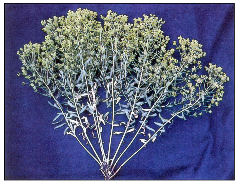
Figure 1. Leafy spurge plant in flowering growth stage.

Herbicides are the most widely used treatment for leafy spurge control. However, control with herbicides is not always practical