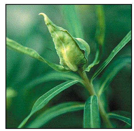
Figure 4. Leafy spurge stem tip galled by Spurgia esulae larvae which prevents seed set

The integrated program may be most useful near wooded areas or rough terrain. Herbicide treatment would prevent leafy spurge spread outside the tree area or inaccessible site and the gall midge would reduce seed production within the areas where herbicides generally cannot be used.