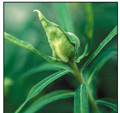
Figure 4. Leafy spurge stem tip galled by Spurgia esulae larvae which prevents seed set.

The integrated program may be most useful near wooded areas or rough terrain. Herbicide treatment would prevent leafy spurge spread outside the tree area or inaccessible site and the gall midge would reduce seed production within the areas where herbicides generally cannot be used.