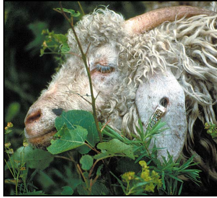
Figure 5. Angora goats will graze leafy spurge and shrubs with minimal grazing of grass species if properly stocked.

Recommended stocking rates vary with terrain, leafy spurge density, and rainfall during the growing season. Sheep should be grazed at approximately three to six head per acre of leafy spurge per month or one to two ewes per acre of leafy spurge for the summer. NDSU research using Angora goats found that 12 to 16 goats per acre of leafy spurge per month or three to four goats per acre of leafy spurge for four months (growing season) controlled leafy spurge with little utilization of the grass species (Figure 5). The stocking rate will decline over time as the leafy spurge infestation is reduced. Prevention of flowering and seed-set by leafy spurge is important. Before moving animals to a leafy spurge free area, they should be contained for three to five days