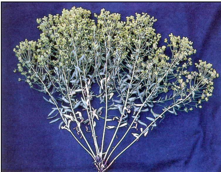
Figure 1. Leafy spurge plant in flowering growth stage.

Herbicides are the most widely used treatment for leafy spurge control. However, control with herbicides is not always practical