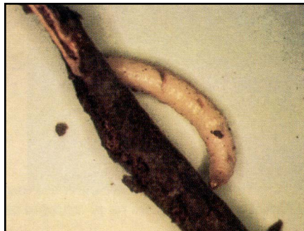
Figure 3. Leafy spurge flea beetle adults feed on the foliage (top), but the real damage to the plants is from larvae feeding on the root system (bottom).