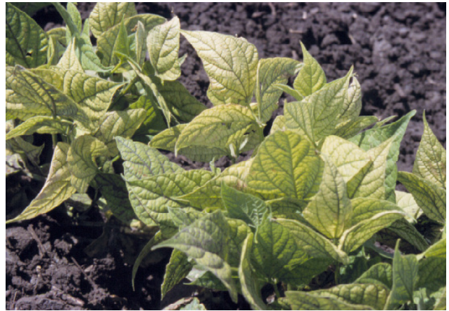
Figure 3. Iron deficiency chlorosis on a saline, calcareous soil near Arthur, N.D.

Iron fertilizer sprays are available but have not alleviated the problem consistently. The severity usually is caused by wet soil conditions that increase soil bicarbonate levels. As soil dries, bicarbonate levels drop and affected plants usually green up. If a field has a known susceptibility to iron deficiency chlorosis, selecting varieties that have shown more tolerance to the conditions is recommended.