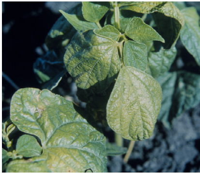
Figure 2. Zinc deficiency in pinto bean.

Foliar applications of zinc chelate products when the plants are small also have been used effectively. Do not apply foliar zinc products with herbicides or other plant protection products because of the chance of increased phytotoxicity to the crop or decreased efficacy to the pest.