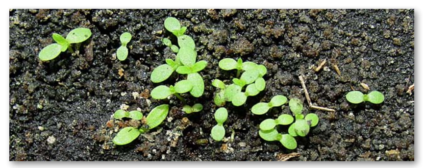
Figure 1. Biennial wormwood seedlings approximately seven days after emergence.

Biennial wormwood is an aggressive and prolific seed-producing plant that has become a problem mainly in soybean and dry edible bean production areas of Minnesota, North Dakota and South Dakota. Biennial wormwood, as its name infers, was primarily biennial when the species first was classified, but weedy cropland biotypes of biennial wormwood are annual plants. Many factors, such as season-long emergence, prevalence in moist environments, adaptation to all tillage systems, tolerance to commonly used soil-applied and postemergence herbicides, and misidentification of biennial wormwood as common ragweed, contribute to increased biennial wormwood infestations. Some herbicides used to control common ragweed do not control biennial wormwood.