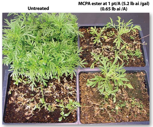
Figure 13. Control of biennial wormwood with MCPA ester, 2,4-D amine and 2,4-D ester.