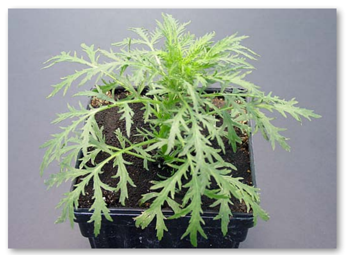
Figure 3. Bolting biennial wormwood plant.

Biennial wormwood is a small-seeded plant that behaves like an annual species. Biennial wormwood stems arise from a tap root, are hairless and often are tinged red. The leaves are hairless and have toothed margins. Plants typically grow 3 to 7 feet (1 to 2 meters) tall with a woody stem averaging 1 to 2 inches (3 to 5 centimeters) in diameter. Biennial wormwood flowers consist of heads in clusters arranged in a spikelike form. Biennial wormwood is a prolific weed, producing approximately 1 million seeds per plant (Stevens 1932). Mahoney and Kegode (2004) later estimated that a single biennial wormwood plant produced 400,000 seeds. Stevens' estimate of seed production possibly was from a biennial plant, whereas the later estimate was from an annual plant.