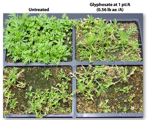
Clarity at 0.5 pt /A (0.25 lb ai /A)