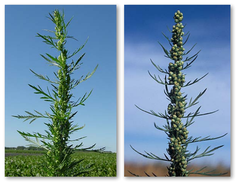
Figure 4. Photo showing spikelike flower head of a mature biennial wormwood plant in early September (left) and mid-October (right) at Fargo, N.D.