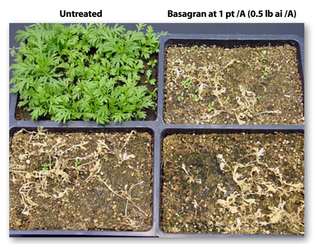
Basagran at 2 pt /A (1 lb ai /A)

Biennial wormwood can go undetected in crop fields until the seedlings are too large to be controlled effectively. Evaluation of Basagran<sup>®</sup>, Liberty<sup>®</sup> and glyphosate in greenhouse studies for efficacy of control of various sizes