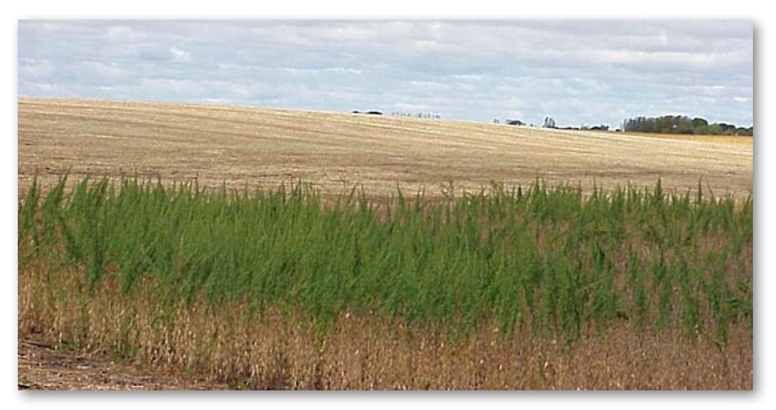
Figure 9. Unharvested section of a soybean field due to a biennial wormwood infestation.

Upon emergence, biennial wormwood seedlings grow slowly and occur as rosettes for much of the early part of the growing season (Mahoney and Kegode 2004). In late July, when day length is declining, biennial wormwood plants bolt as they prepare to reproduce and appear above the canopy of crops such as soybean (Figures 4 and 9).