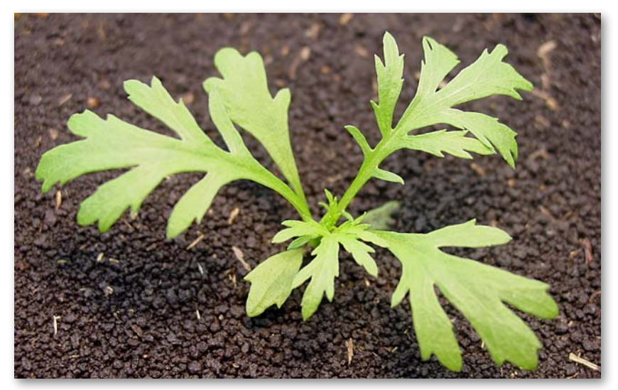
Figure 2. Biennial wormwood seedling approximately three to four weeks after emergence.