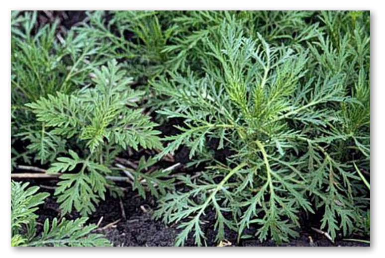
Figure 6. Comparison of biennial wormwood (right) and common ragweed (left) plants growing next to each other in the field.

Seedling emergence can occur during the entire crop growing season under moist conditions and favorable environmental conditions. Characterization of emergence patterns in eastern North Dakota indicated that the weed began to emerge in late June or early July in corn, dry bean, soybean and sunflower (Kegode and Ciernia 2003). Biennial wormwood grows slowly after emergence, remaining as a rosette until midsummer, when plants bolt and growth becomes rapid. Biennial wormwood often is confused for common ragweed (Figure 6).