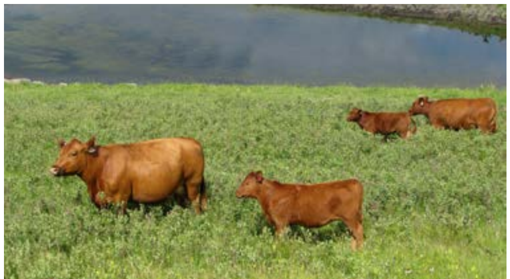
Water is an important nutrient for livestock. Water quality can affect livestock performance and health.

Salts may be toxic at high levels. Substances that are toxic without much effect on palatability include nitrates and fluorine, as well as salts of various heavy metals. Other materials that may affect palatability or toxicity include pathogenic microorganisms.