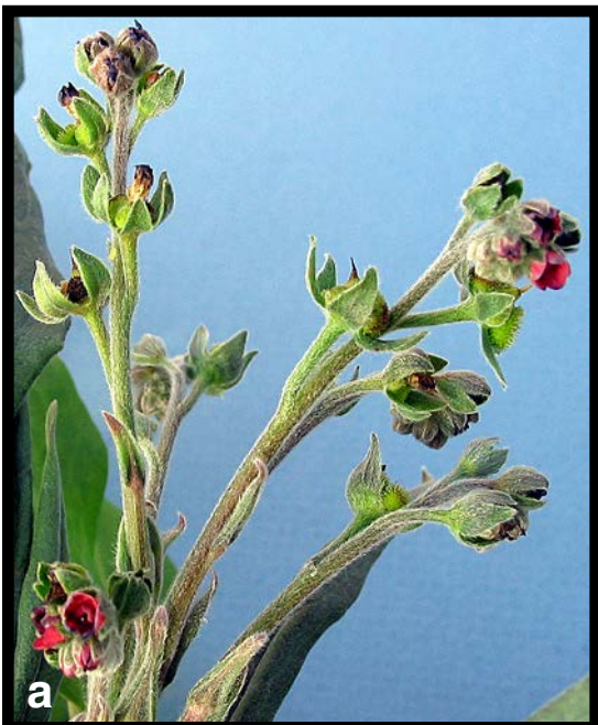
Figure 2. Houndstongue bolts early in the summer during the second season of growth and produces small red to burgandy flowers (a). The flowers are inconspicuous and bloom in series for several weeks (b).

and flowers the second season. The plant only reproduces from seed, but it can spread great distances because the barbs on the nutlets cling to clothing, machinery and animals. Plants generally are found along trails and roadsides, on the edge of wooded areas and in disturbed habitats.