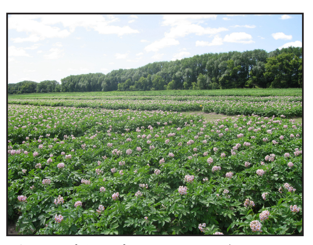
Northern Plains Potato Growers Association

Hoverson Farms, Inkster Irrigation Site & Hoople Twilight Tour at Oberg Farms