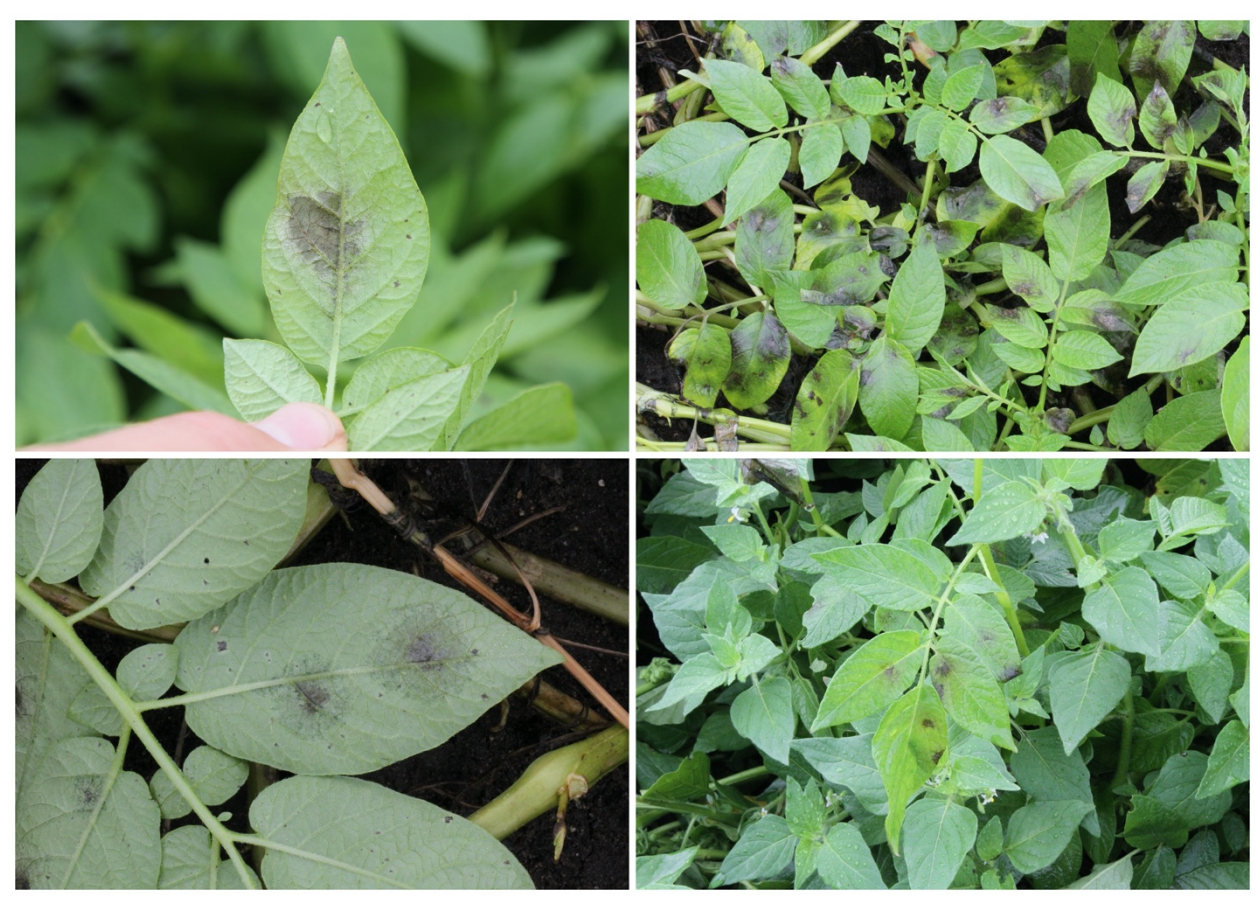
Figure 1. Late blight lesions expand rapidly into large, dark brown or black lesions, often appearing greasy.