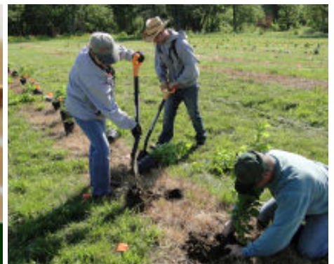
Figs. 1–3. Hybrid hazelnuts are bigger and more flavorful than American hazelnuts.

The shrubs start producing in four years and reach their peak after 8 years. Yields of 1–2 pounds per bush can be expected.