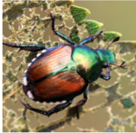
Fig. 4. Japanese beetle skeletonizing leaf.

Get to know this enemy and look for it—especially if you planted any trees or shrubs this spring. The beetles are emerging out of the soil now. Inspect the pots for cocoons.