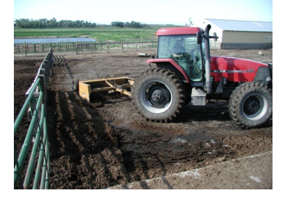
Pen cleaning with a box scraper.

Allowing manure to build up in barnyards and open lots when it is wet makes it harder for animals to move and feed. They use more energy to walk, and contribute more pollutants to runoff when it rains. Collect manure from barnyards and lots monthly to reduce buildup and