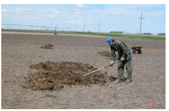
Applying manure to a research plot.

nitrogen demanding crops, such as wheat. However, fall manure can have the most money returned per acre because of its cost effectiveness. Additionally, fall manure applications produce higher yields and better quality spring wheat than spring applied manure. Chris Augustin