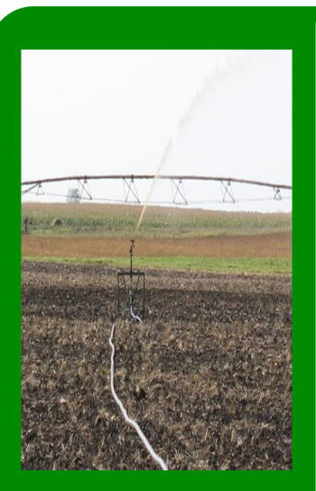
Traveling gun applying containment pond effluent on a field.

"During the spring melt, monitor your pond and record its level regularly. Inspect the diversions and dikes for erosion ... "