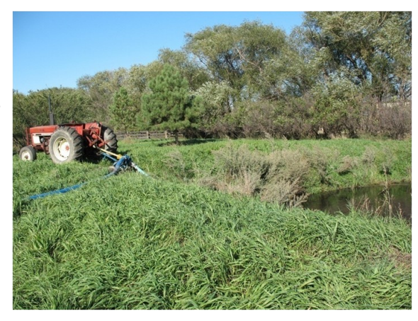
Pumping water effluent from a containment

Karl Rockeman- North Dakota Department of Health