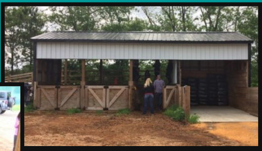
Manure management and composting bins at Blue Skies Stables.