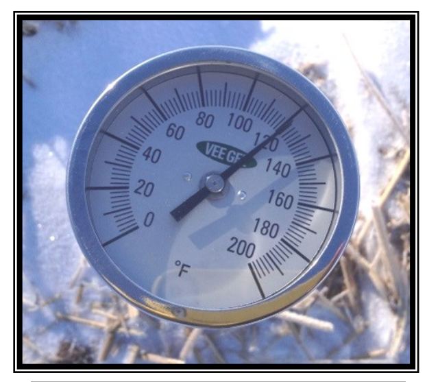
On January 31, 2014 the air temperature was 1 degree F while the internal pile temperature was 120 degree F!