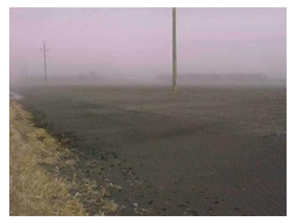
Dust storm northern Red River Valley about 2005.

at present rates. New data describing soil loss from North Dakota soils since 1960 indicates that we have lost another 30 years of P application. If no new soil was lost, it would take 70 years of P application return to P levels in 1882. No-till and strip till are needed to stop the export. Minimum till is not enough.