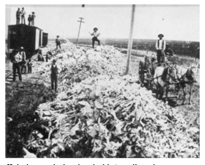
Buffalo bones being loaded into railroad cars near Krem, ND, Dunn County, 1880's.

Totten and other depots, sold for cash up to $15 per eastern US which did not consider wind erosion. So ton, which was big money in those days, and the set- when the soil was dry, the soil blew. Dust storms were tlers used the cash for food to survive or upgrades to very common in the 1920's, 1930's up to today. Dust their sod houses. From about 1880 to 1892 when the doesn't just settle in the ditch; accounts from the trade all but ended, my estimate is that about 1930's by aviators describe dust clouds up to 14,000 32,000,000 pounds of bones were shipped east for feet in elevation. Dust travels thousands of miles. The fertilizer and industrial uses from North Dakota. The P content of the dust that settled in east coast US nutrient content of bone is about 3-15-0, or about 15% states was 19 times that of what remained on the phosphate (P). Using these figures, we can estimate prairie. The wind still blows today. In the 1930's North that shipped about 2 years phosphate application east Dakota lost the equivalent of 40 years of P application at todays' historic high present rates.