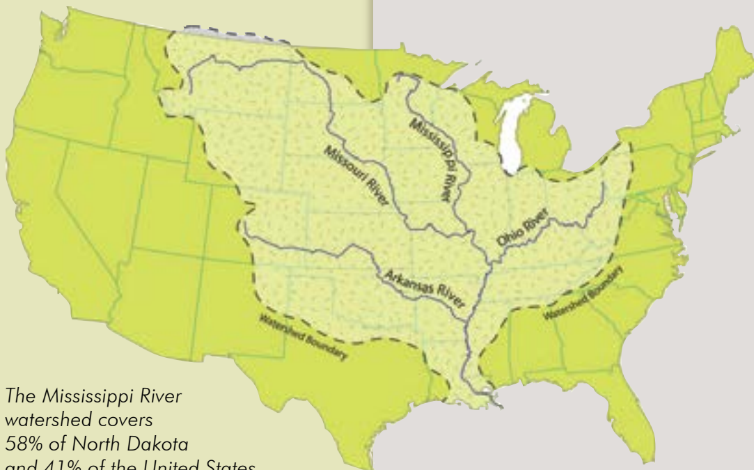
The Mississippi River watershed covers 58% of North Dakota and 41% of the United States.