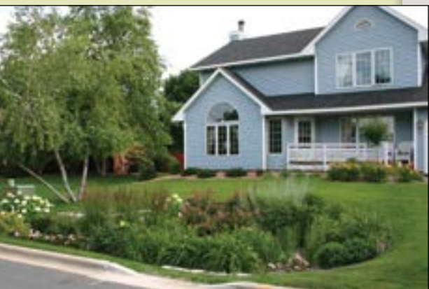
Rain gardens are shallow depressions that capture and treat stormwater naturally.

Feel free to use this information, but please credit the North Dakota Department of Environmental Quality.