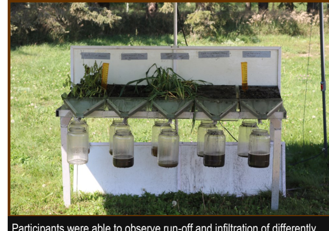
Participants were able to observe run-off and infiltration of differently manured soils using the rainfall simulator.

servations of the cotton material or lack thereof were shared.