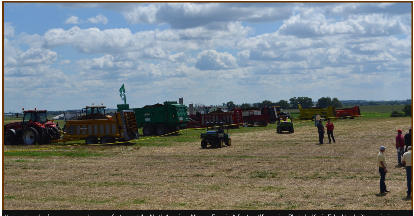
Various brands of manure spreaders were features at the North American Manure Expo in Arlington, Wisconsin.

This method works well for solid manure applications.