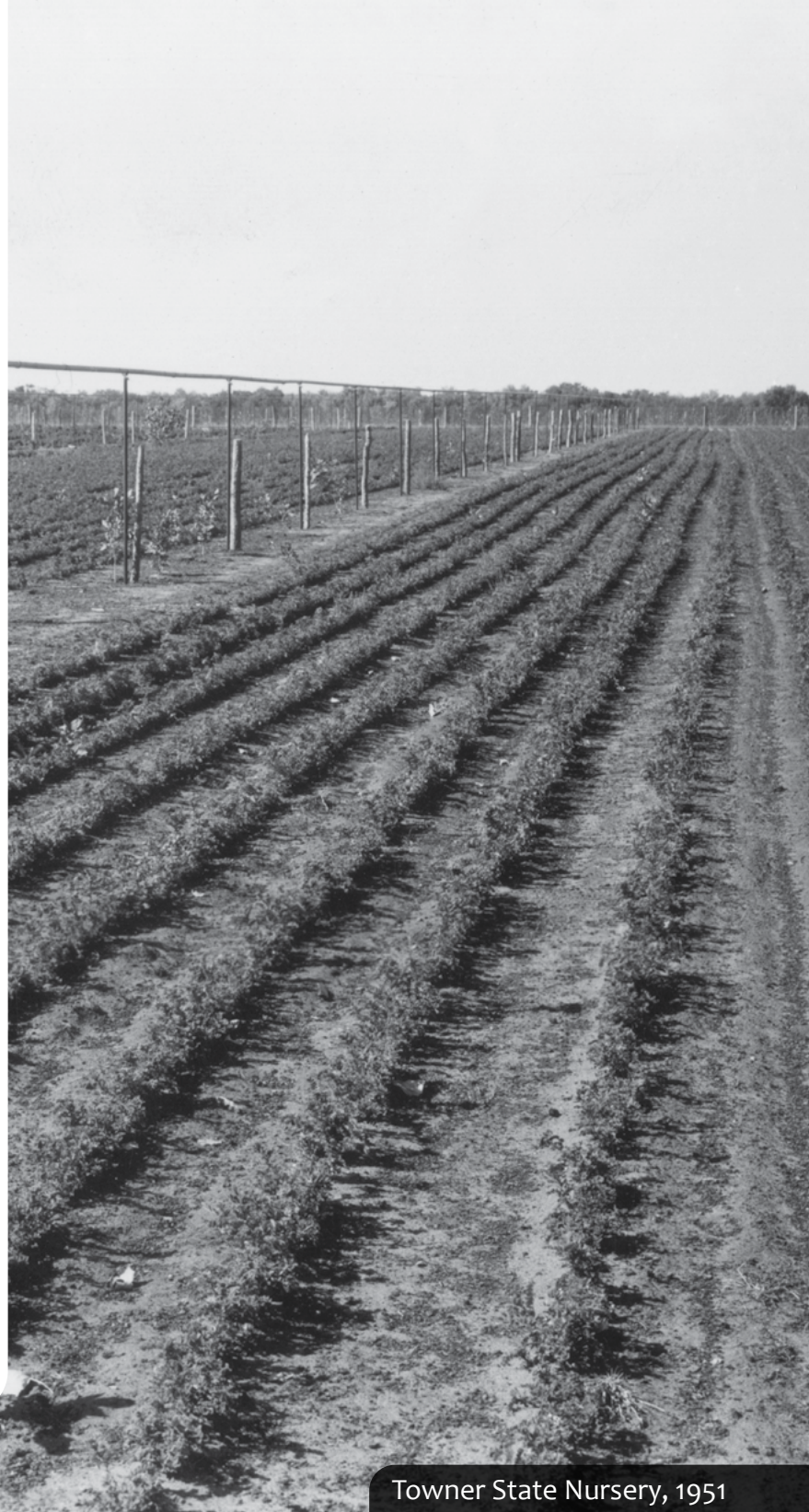
Towner State Nursery, 1951