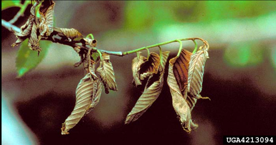
▲ Figure 2. Wilting leaves on a flag branch is a characteristic symptom of DED.