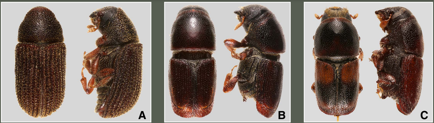
Figure 1. The three species of bark beetle found in North Dakota that spread DED: (A) native elm bark beetle— Hylurgopinus rufipes , (B) smaller European elm bark beetle— Scolytus multistriatus and (C) banded elm bark beetle— Scolytus schevyrewi .