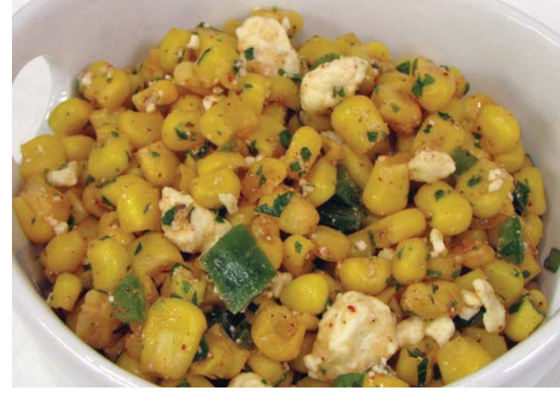
Here's a delicious dip recipe that's perfect with whole-grain crackers or chips as a snack.