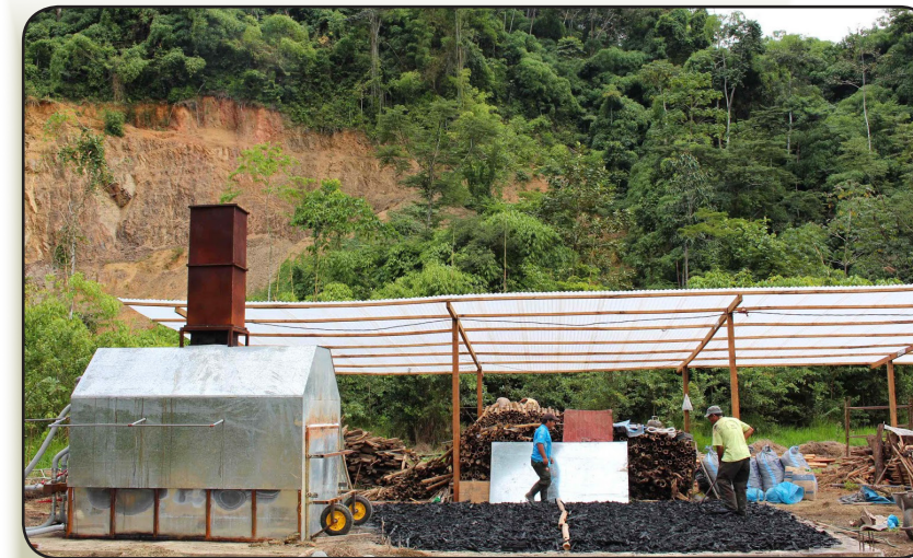
A large-scale retort kiln produces biochar from locally-sourced biomass