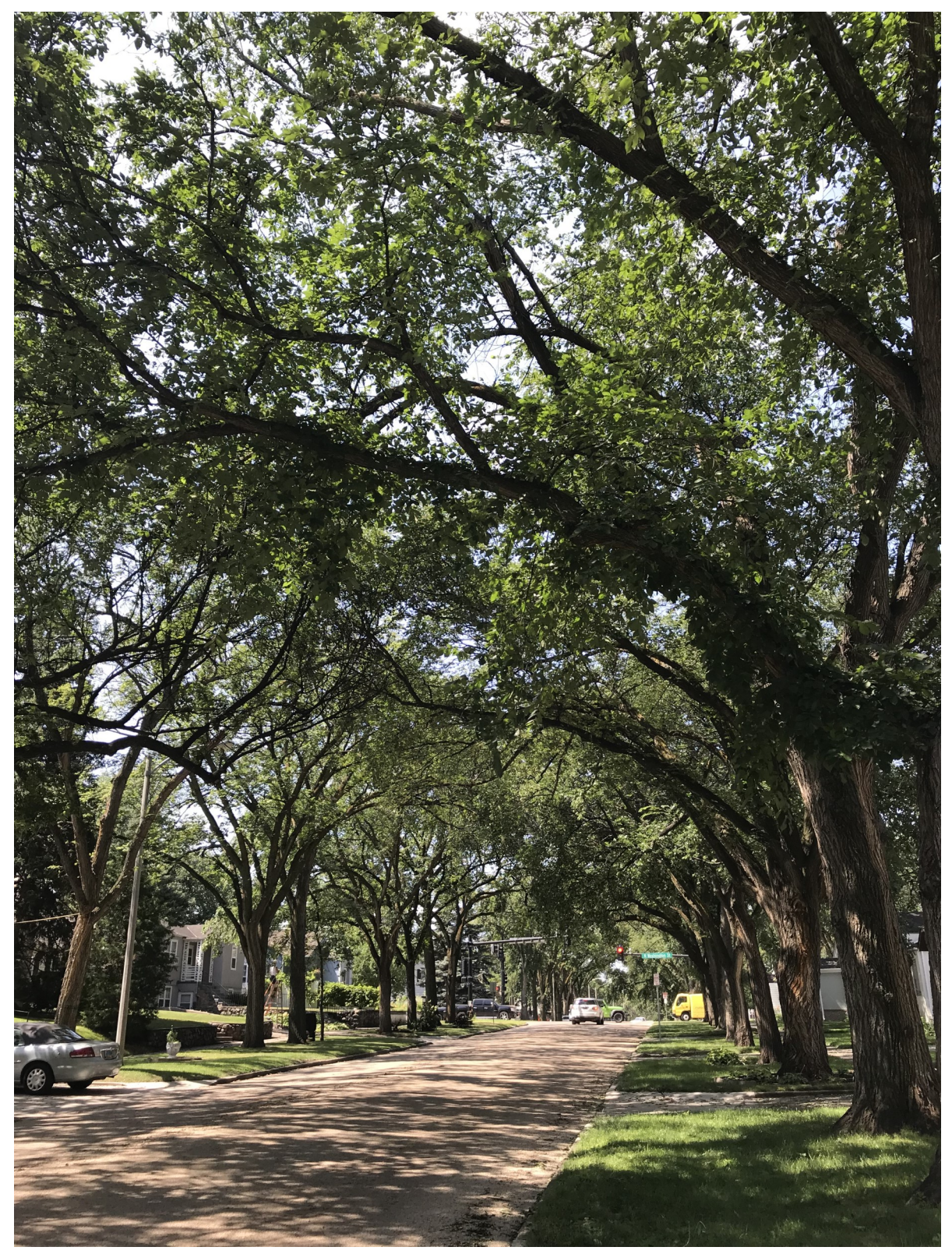
American elm lined street, Bismarck 2019