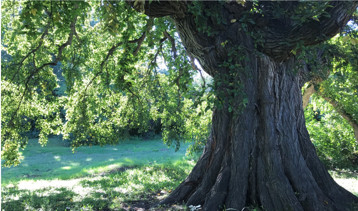
Champion American elm, Lisbon ND