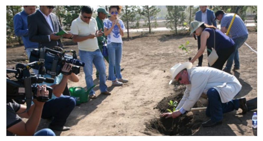
US Ambassador George Krol and Embassy staff planting bur oak saplings from the Towner State Nursery in Kazakhstan for Astana's new Botanical Garden in honor of EXPO 2017 on August 30.

President Donald J. Trump sent a Presidential Delegation to the Republic of Kazakhstan to attend the EXPO 2017 International Fair on "Energy of the Future" in the capital city of Astana in August. ND Congressman Kevin Cramer was a member of the Delegation. Cramer delivered bur oak saplings from the