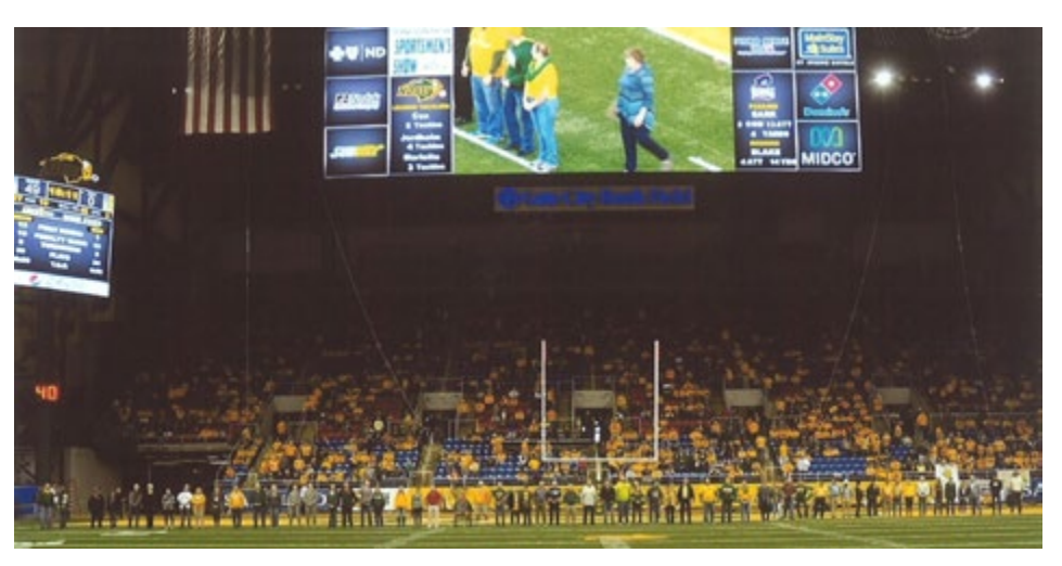
The 2017 award winners recognized at the Fargodome during half-time.

first tribal college. Montana-Dakota Utilities is the only Tree Line USA in the state.