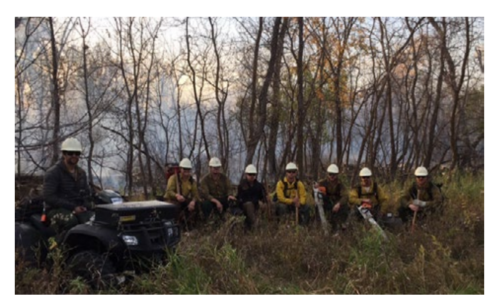
ND Forest Service firefighters assisting the Mandan Rural Fire Department and the North Dakota Game and Fish Department in the Little Heart Bottoms south of Mandan. The fire was contained to 50 acres thanks to the great coordination and cooperation of all agencies involved.