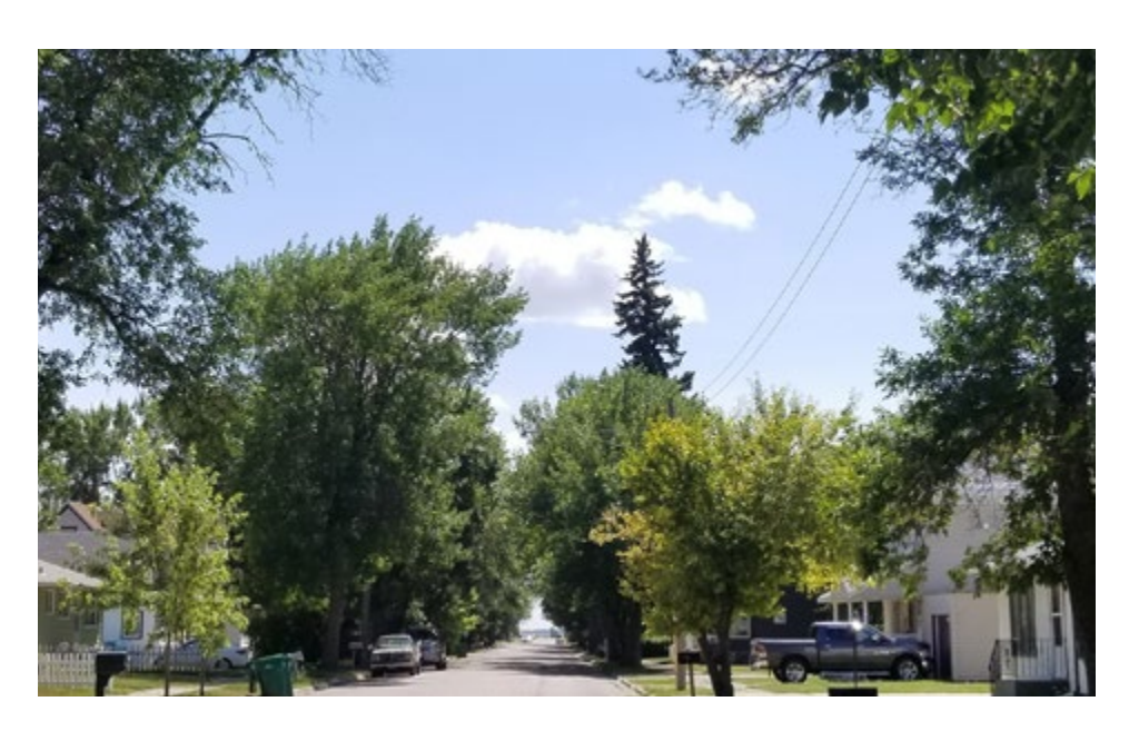
A tree inventory is the collection of information about the health and diversity of the community forest. An online Tree Inventory Planning (TIP) tool will be available in January 2018. TIP will give communities instant access to their inventory, which can be used to make management decisions and develop grant applications.

After attending a short training workshop, communities will be able to update their own inventory, adding trees they have planted and removing those they have lost. An Emerald Ash Borer Cost Calculator will be available