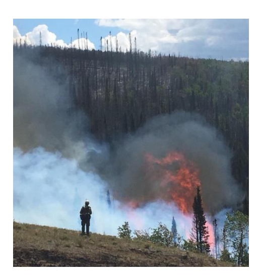
ND Forest Service fire staff sizing up Beaver Creek fire in Colorado this past summer.

The North Dakota Forest Service (NDFS) Fire Management staff is wrapping up another busy year with fire suppression assignments across the state and the United States. NDFS firefighters were requested in state by several North Dakota fire departments for suppression assistance along with the Standing Rock Sioux Reservation.