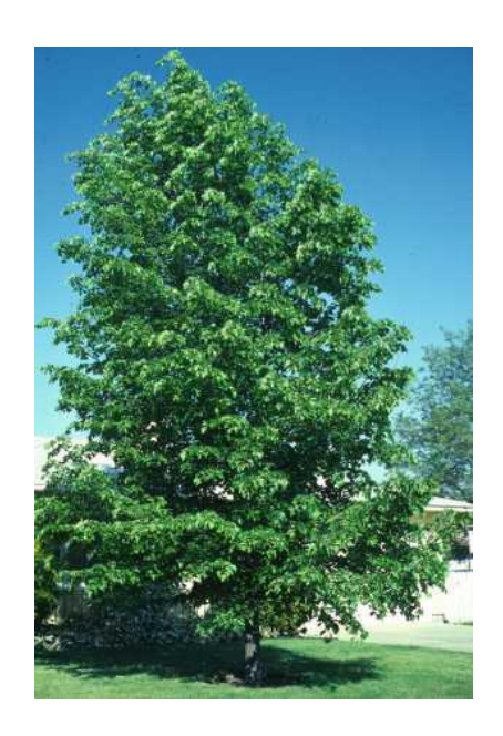
Bur-gambel oak is a hybrid that grows fast and produces acorns at a young age.

Please contact the nursery with questions on your next planting at (701) 537-5636 or tnursery@srt.com.