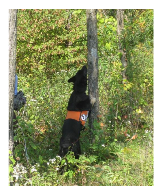
Tia inspects a live ash tree and alerts her handlers to an infestation.

The idea of using dogs for scent detection isn't new. Law enforcement agencies and the military have long trusted dogs to use their superior sense of smell to locate suspects, drugs, and bombs. Working Dogs for