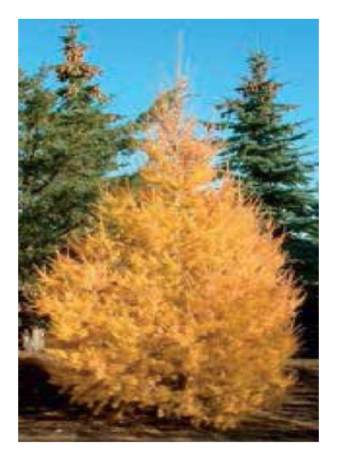
Siberian larch are a deciduous conifer that turn a beautiful gold in the fall.

Be sure to check out the full catalog, which is also available online at www.ndsu.edu/ndfs/documents/2016catalog.pdf. It includes additional information on how to care for your nursery stock, types of nursery stock, selecting the type of stock and species, and storage tips for bare-root and container (plug) stock.