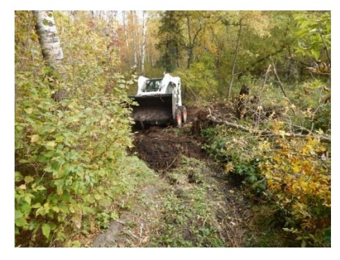
Connecting trails will expand access and create a more enjoyable experience.

The trail system on the Turtle Mountain State Forest has been difficult to maintain due to abnormally high amounts of precipitation over the last ten years. The goal of the Trail Restoration and Improvement