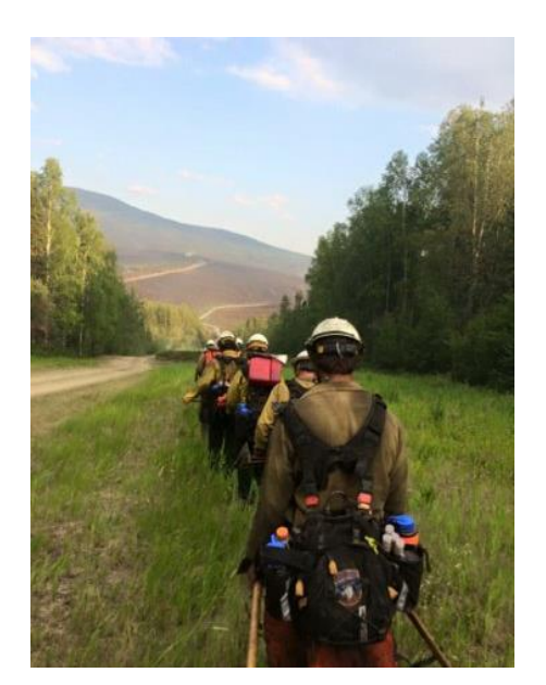
ND Forest Service fire crews worked on fire suppression efforts in Alaska this summer.

The fire management staff is currently planning its winter training schedule. With numerous requests from rural fire departments and the fire management's partnership with the North Dakota Firefighters Association for its State Fire School, it looks to be a busy winter. To request wildland fire