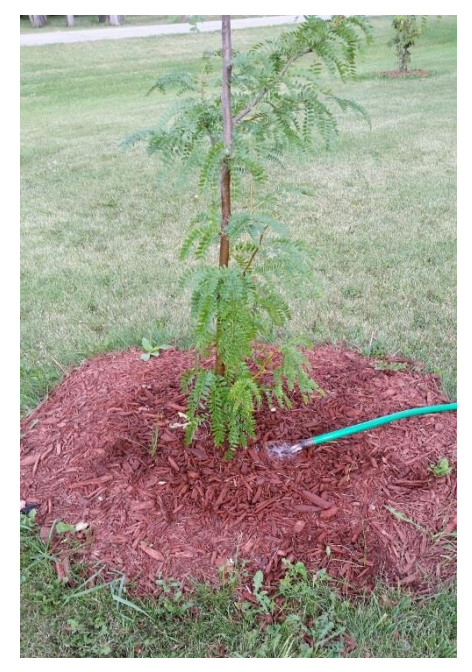
A properly mulched, newly planted honeylocust tree receiving some fall watering.

As homeowners begin fall cleanup in preparation for the coming North Dakota winter, certain steps can be taken to help trees make it through the challenging season in good health.