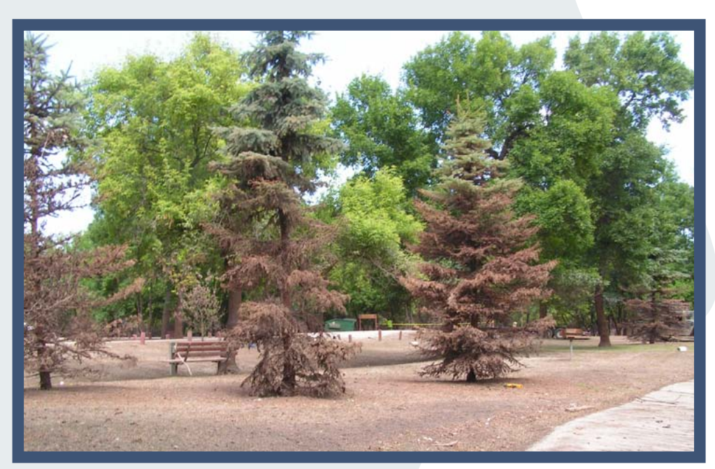
Conifers are intolerant of flooding that occurs during the growing season.

Trees that have a significant portion of their canopy above the floodwaters likely will survive with little or no damage. Trees that are stressed prior to flooding will be more susceptible to damage imposed by flooding.