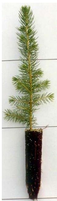
Container (Plug) Stock

Container (Plug) Stock: As the name implies, container stock is grown in individual containers not in outdoor fields. Container stock is grown in a greenhouse at the Towner State Nursery. The trees are started from seed in a potting mixture of peat and vermiculite. The trees are grown in a controlled environment in a greenhouse. Optimum temperature, humidity, water, fertilizer, carbon dioxide, and light are provided to allow maximum growth. The trees reach a marketable size in seven months or less. Trees are grown in individual containers made of Styrofoam or plastic. Trees are extracted from the container and packaged in cardboard boxes for shipment. These container (plug) trees can be either machine or hand planted.